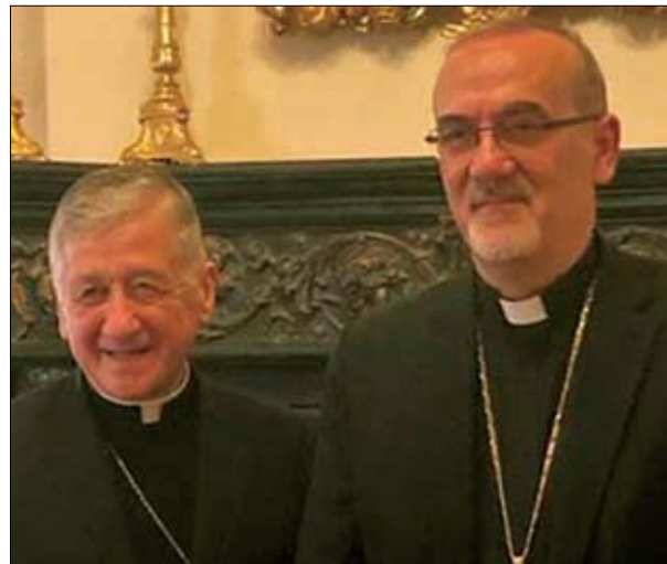
Cardinal Blase Cupich and Cardinal Pierbattista Pizzaballa.