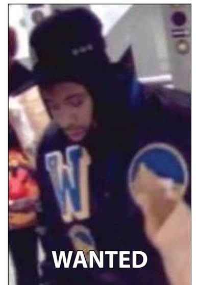
Man wanted for attack at the Granville Red Line CTA station.

Anyone who recognizes him can contact Mass Transit Unit investigators at 312-745-4706. The case number is JH130990.