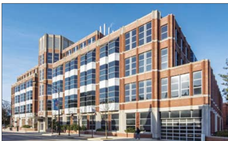
The 2430 N. Halsted building owned by Sterling Bay, that houses BioLabs, is situated in the heart of Lincoln Park and features state-of-the-art wet lab space.

The Massachusetts-based firm is an international, membership-based network of shared lab and office facilities located in key