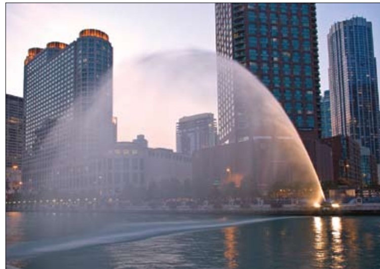
The Centennial Fountain water arc.