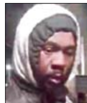
Surveillance images of a man being sought for mail theft in Lincoln Park and Old Town.

Therault and Wellington were released from the police station with notices to appear in court.