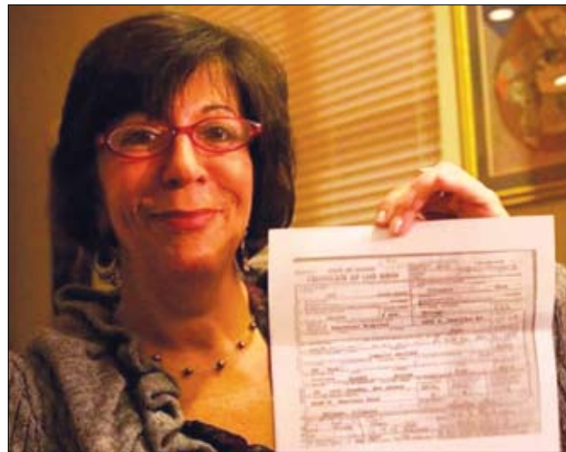
Sen. Sara Feigenholtz