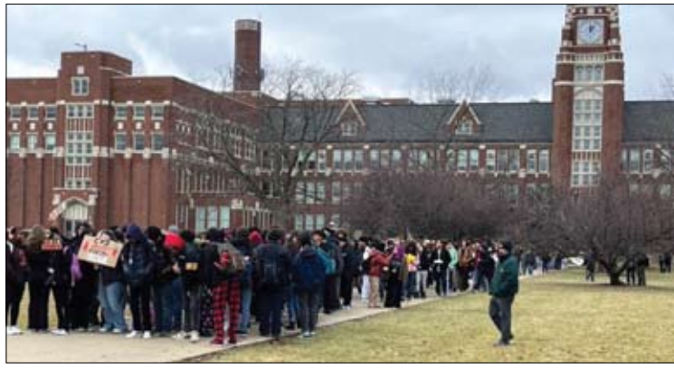
Lane Tech High School students - and students at many other public schools - staged a noon walkout Jan. 30 in support of a proposed Chicago City Council resolution calling for a cease-fire in Gaza.