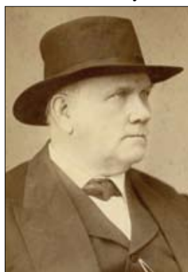
Long John Wentworth