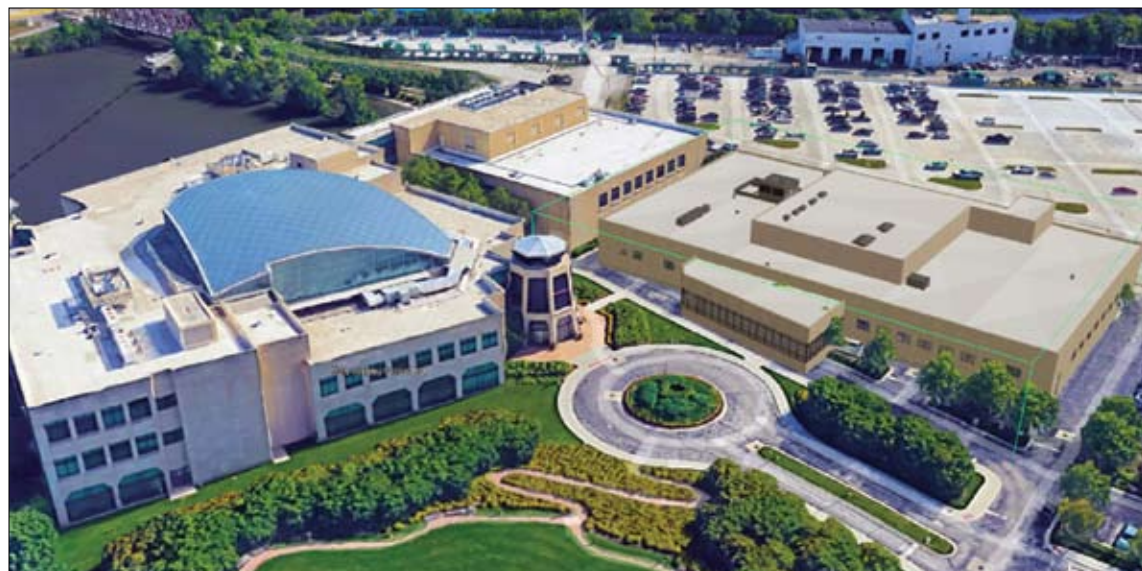
Mars, Inc.'s new Research and Development Center on Goose Island.