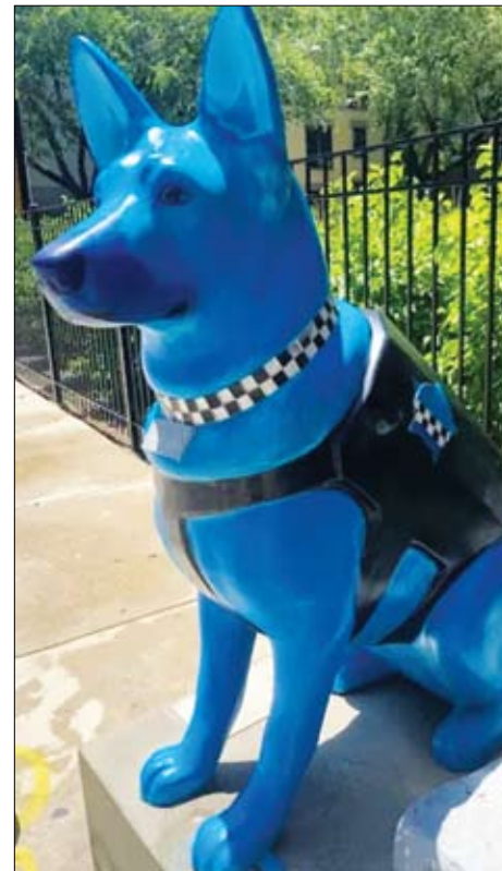
"Muddy" the missing Police K9.