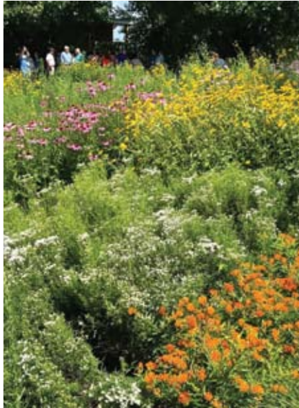
Research shows that residential and corporate landholders can be valuable partners in creating habitats that protect the Monarch butterfly and other essential pollinators.

plants that bloom throughout the entire growing season.