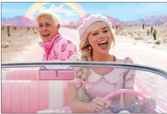
Barbie and Ken go for a ride.

What will second, third and fourth graders make of Miss Bar-