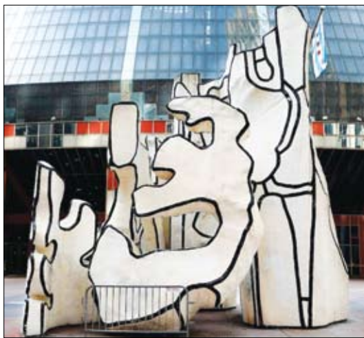
Monument with Standing Beast by Jean Dubuffet in front of the Helmut Jahn designed James R. Thompson Center.