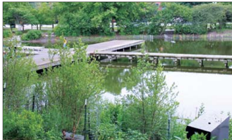
The North Pond casting pier [above] is rooted in the history of casting clubs in Chicago. The current concrete pier dates to 1946. It replaced an original wooden structure.