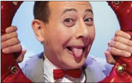
Paul Reubens aka Pee-wee Herman