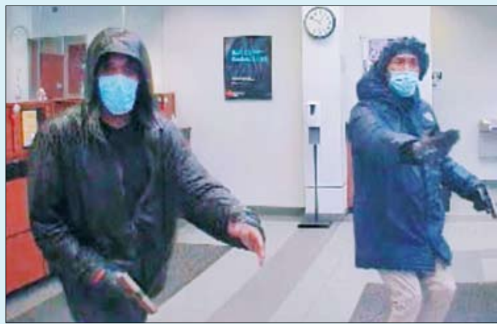
Two gunmen rob Byline Bank, 7050 N. Western Ave., Dec. 23, 2023.

The robberies strongly resemble two other robbery sprees reported