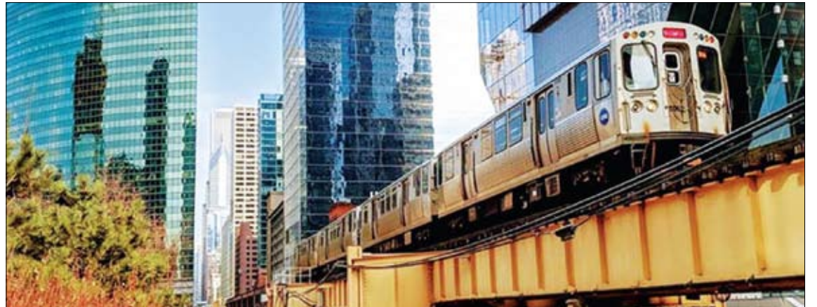
The CTA's financial troubles are on the horizon as rides are still down 40% for the CTA compared to the same period for 2019, the last pre-COVID year.