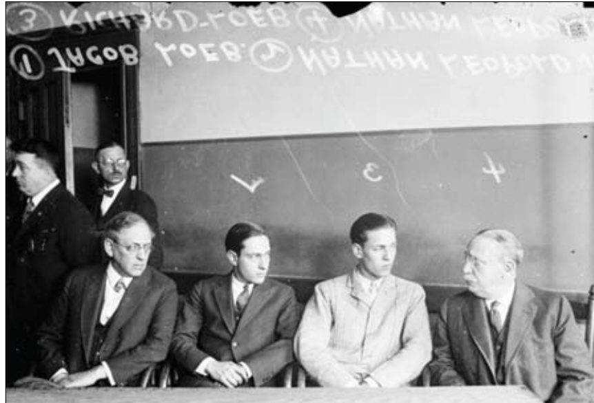
(L) Al Capone leaving court during trial for tax evasion, Chicago, c. 1931. (R) Jacob Loeb, Nathan Leopold Jr., Richard Loeb, and Nathan Leopold Sr. sitting at a long table in a room in Chicago, before Richard Loeb and Nathan Leopold Jr. went on trial for the murder of Bobby Franks, June 2, 1924.

The newly available True Crimes LibGuide is a digital treasure trove to help people explore the Chicago History Museum's holdings on the enigmatic world of Chicago's criminal underworld.