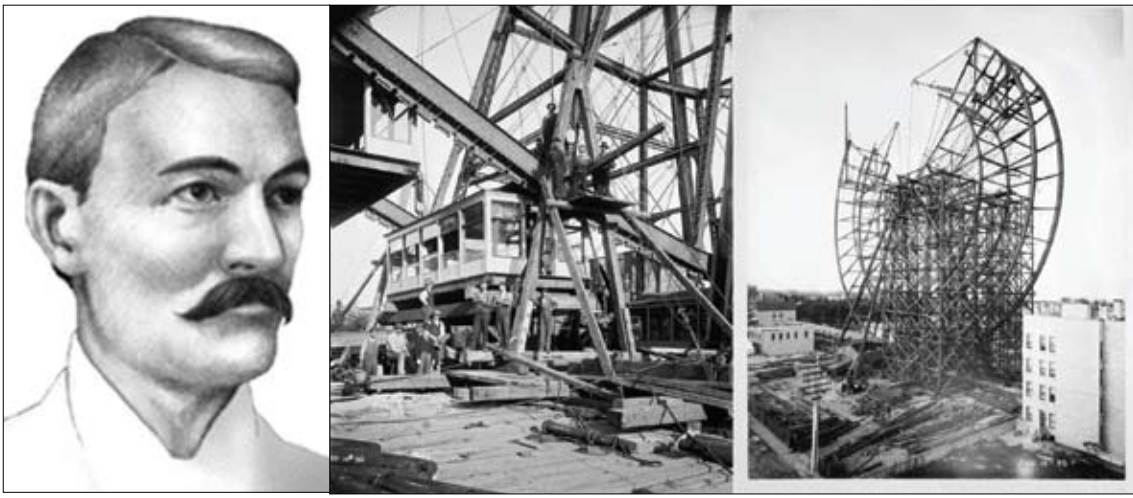
[L-R] George Washington Gale Ferris Jr., inventor of the Ferris wheel. Workers reconstructing the Ferris wheel on N. Clark St. near Wrightwood Ave., 1895. Ferris wheel re-erection on Clark St., Aug. 14, 1895.