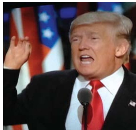
(Left) Chicago Police Commissioner Larry Snelling. (Center) ICE agents march through Downtown. (Right) President Donald Trump.