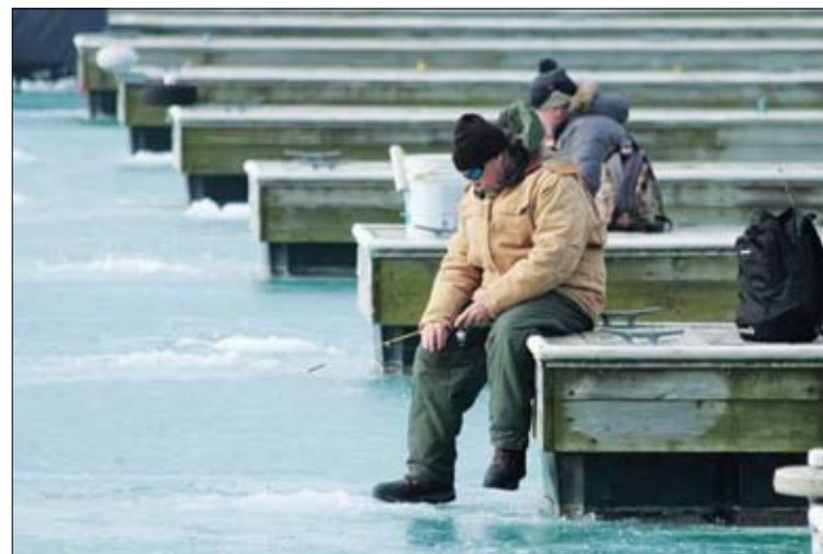
Hot spots for ice fishing include DuSable, Diversey and Belmont Harbors, the Lincoln Park Lagoon and Montrose Harbor, with ice forming well enough for ice shelters in winter.