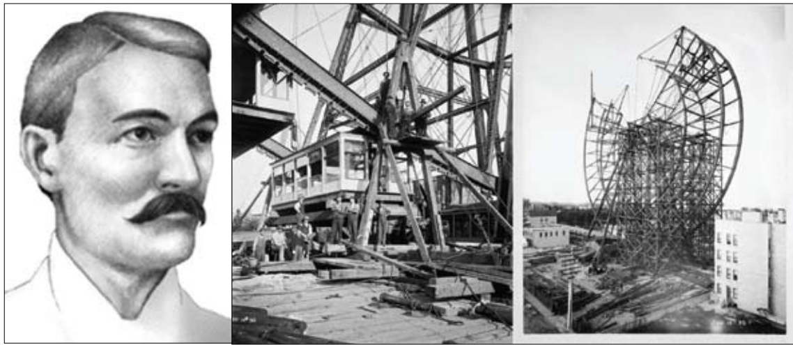
[L-R] George Washington Gale Ferris Jr., inventor of the Ferris wheel. Workers reconstructing the Ferris wheel on N. Clark St. near Wrightwood Ave., 1895. Ferris wheel re-erection on Clark St., Aug. 14, 1895.