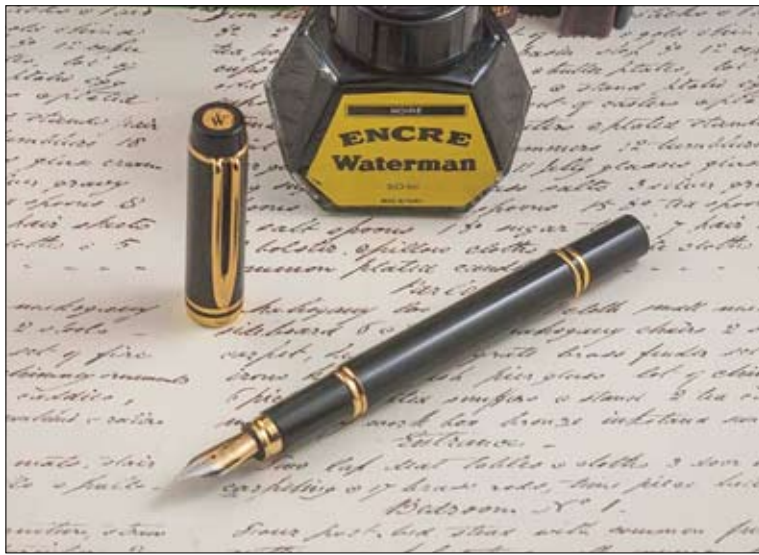
A Waterman Opera Pen atop a notebook.

architectural analyses of Church designs and treasure painted on the walls included. Especially out of the way shrines and quiet corners of the city. I appreciate what I wrote very much, the words bring everything back to me quickly. And of course with our plans and projects I get to add an ending as to how everything turned out. That's important too.