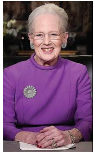
Queen Margrethe II