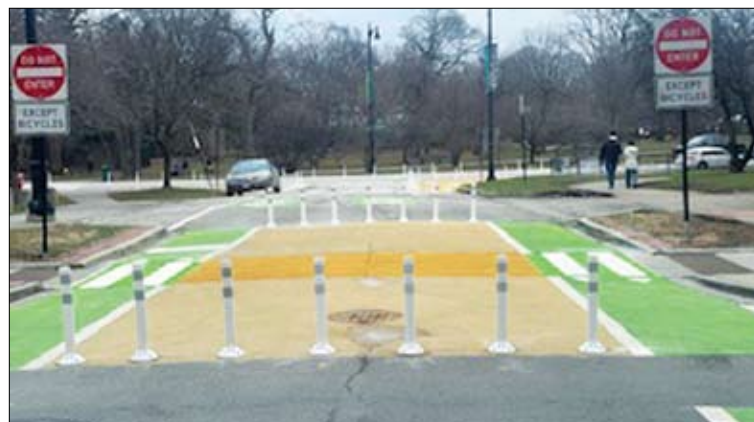
Dickens Dr. is now blocked at the intersection with Stockton. There are posted signs saying, "Do not enter except bikes." Chicago Park District employees can also use the block to park their cars on.

In October, work began on a contraflow bike lane that allowed cyclists to travel in both directions along the one-way stretch of