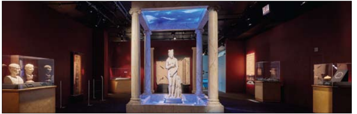
This is your last chance to go see the special exhibit at the Museum of Science and Industry on the Roman city of Pompeii, which disappeared after it had been buried under volcanic ash from Italy's Mt. Vesuvius volcano. The exhibit ends Jan. 15.

Have something on your mind about your community? Write a Letter To The Editor at insidepublicationschicago@gmail.com