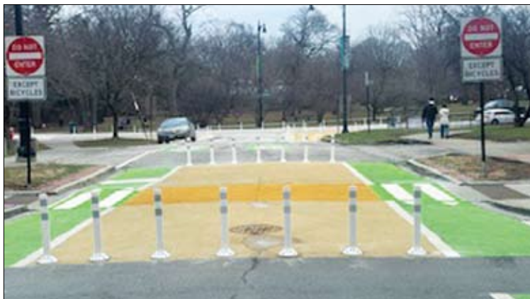
Dickens Dr. is now blocked at the intersection with Stockton. There are posted signs saying, "Do not enter except bikes." Chicago Park District employees can also use the block to park their cars on.