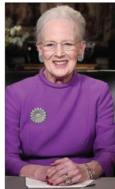
Queen Margrethe II