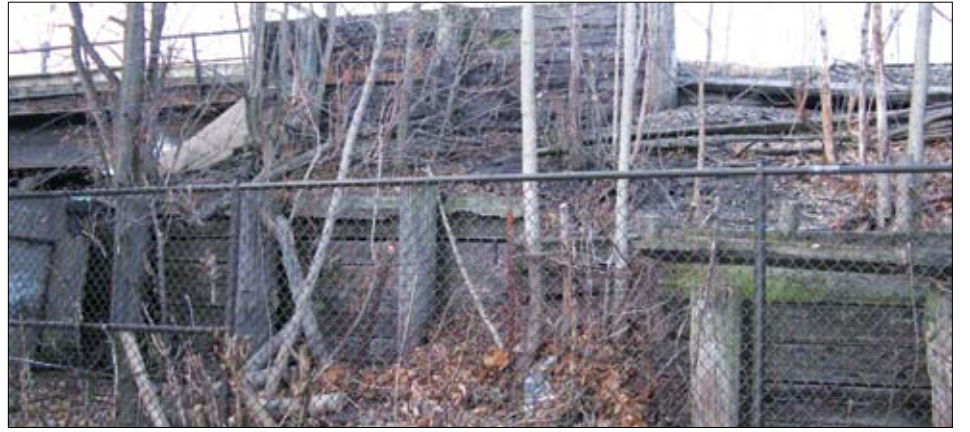
Does anyone recall a fire at the Kenmore Station, along the Chicago & Northwestern Railroad tracks between Granville and Thome in Edgewater?

Now I'm trying to find out the date, and any documentation or news reporting of it, so it can be put into the story of the soon-to-be-completed (expected Jan. 18) sta-