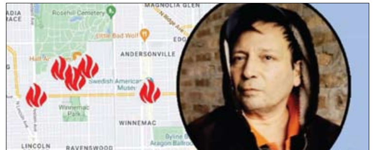
Chicago police released this surveillance image of a man wanted for setting at least five fires in Lincoln Square and Ravenswood on Jan. 3.