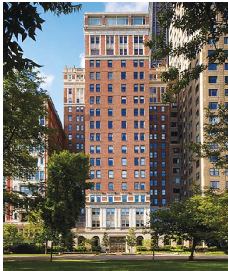
The Mayfair building, 189 E. Lake Shore Dr. has two of the top five highest tax bill increases county-wide over the past 20 years.

Runaway real estate tax hikes have been a major problem in Chicago and Cook County for decades, especially in tony North Side city neighborhoods.