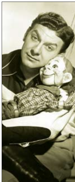
Buffalo Bob Smith with Howdy Doody.