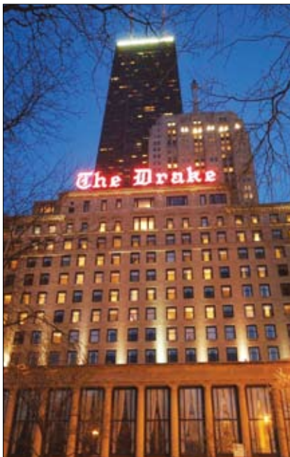
Happy 100, Drake Hotel.