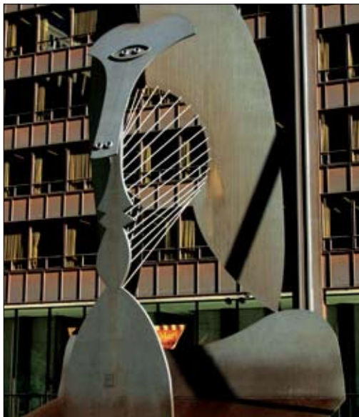
(L) In 1967, the Chicago Picasso was unveiled to the sounds of the Chicago Symphony Orchestra and a poem written specially for the occasion by Gwendolyn Brooks. (R) A portion of a Ray Patlán mural at 1831 S. Racine Ave.