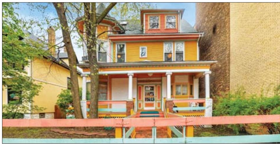
The house at 1525 W. Pratt Blvd. competes on "Ugliest House in America."