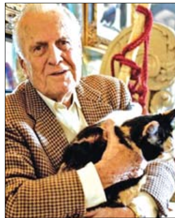
Sir John Richardson.