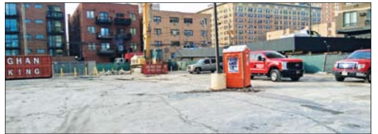
The current 6150 N. Sheridan Rd. site.