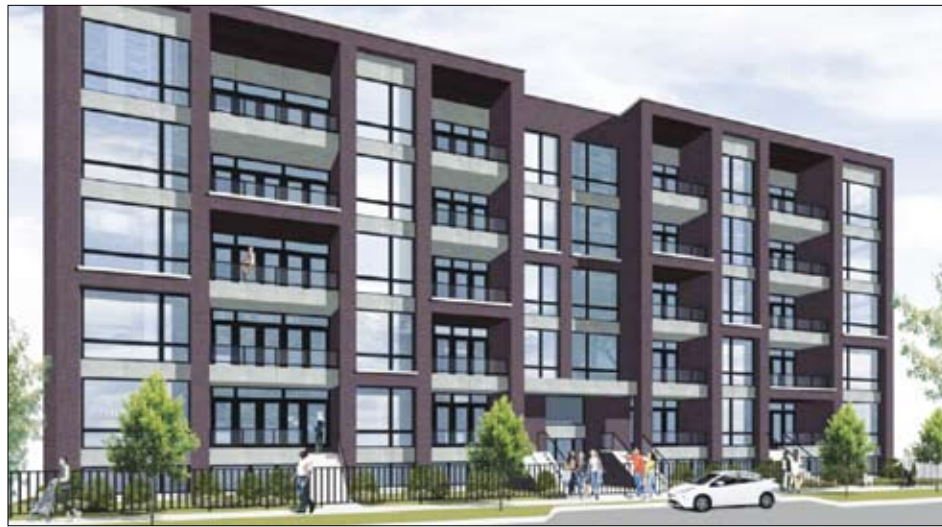
Artistic rendering of 6150 N. Sheridan Rd by Hanna Architects

Founded in 1988, the Edgewater Historical Society is one of Chicago's leading community-based historical societies. Its free museum is located at 5358 N. Ashland Ave.