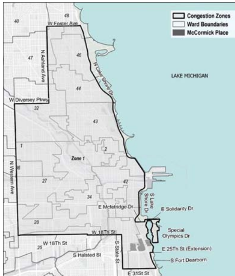
Chicago GTT TNP Congestion Zone 1 Boundary.

The city's downtown congestion fee for rideshares went into effect in 2020. Congestion zone 2 exists in the Hyde Park community.