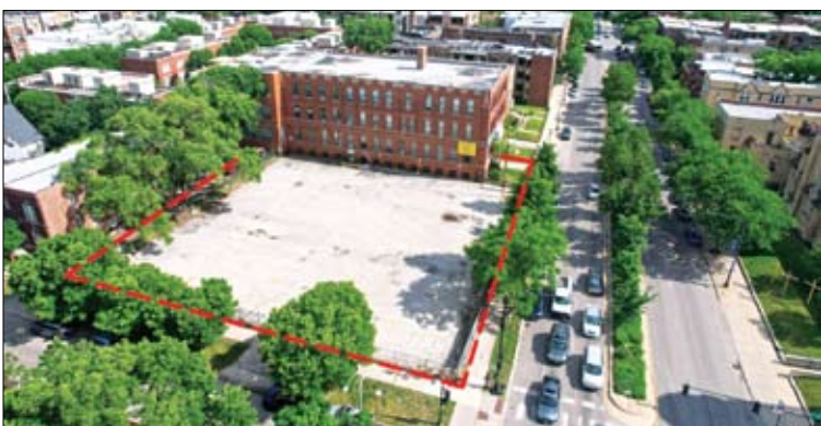
The Our Lady of Lourdes Church parking lot [below] may soon sprout a new housing project [above].