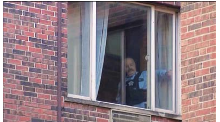
A Chicago police detective inspects the window of the fourth floor 5820 N. Sheridan Rd. apartment.

At this early stage, the ME's Office called the toddler's man-