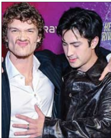
Hudson Williams and Connor Storrie.