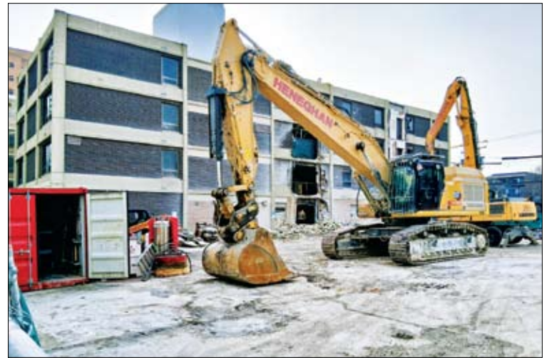
The former Kindred Chicago Lakeshore Hospital undergoing demolition by Heneghan Wrecking.