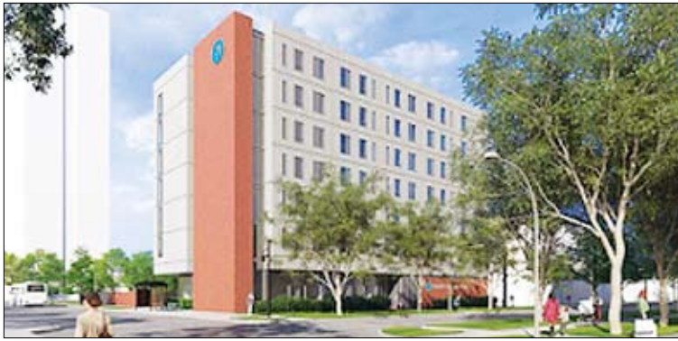
Sarah's Circle hopes to acquire at least a portion of the empty Uptown lot on Clarendon between Agatite and Sunnyside to erect this building.