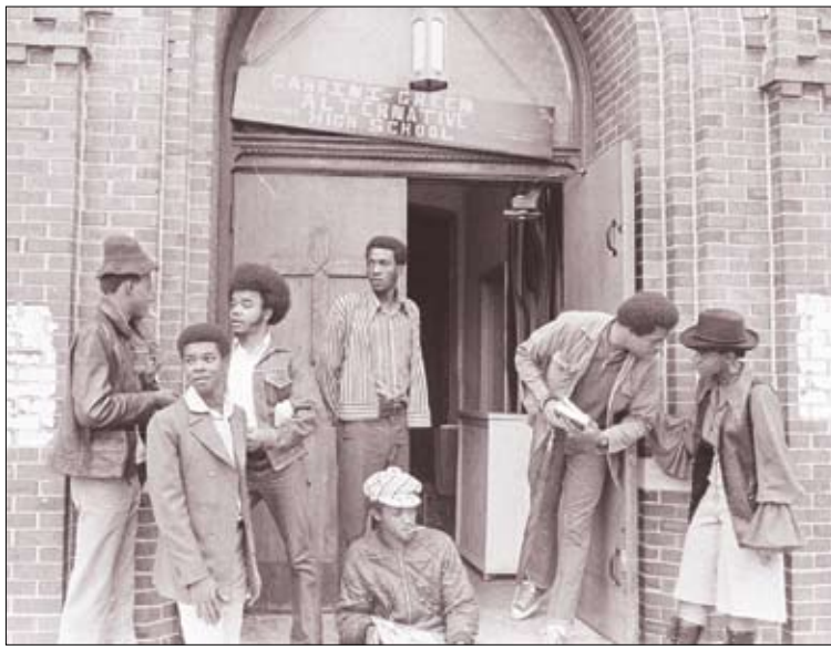
Young men and women in 1971 stand outside the Cabrini-Green Alternative High School, 357 W. Locust St., in Chicago. It is now the location of a condominium building.

Second, because many of the subsidized mixed-income units