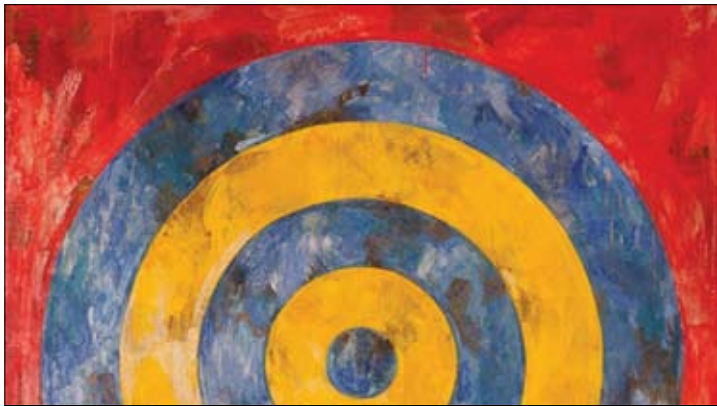
Target, 1961, Jasper Johns.