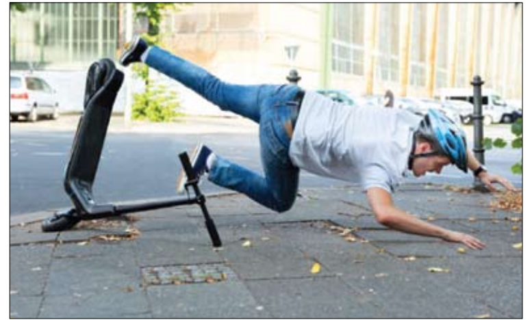
Electric scooters have brought with them a wave of scooter-related injuries and even recent deaths. A study by the Univ. of North Carolina has tracked 56 deaths since 2016.