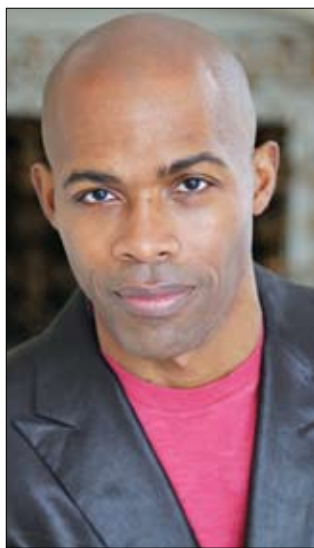
Dr. Ian K. Smith.

"I'm excited because this novel is Chicago," said Dr. Smith, who has authored more than 20 books and served two terms on the President's Council for Fitness, Sports, and Nutrition under President Barack Obama, among the many other notable things he's done. "It's not network polished... I see Chicago as an amazing city because all of what it has good and bad. I want to create a show honest to the city. I want to take people into all the neighborhoods and show them the grit and vio-