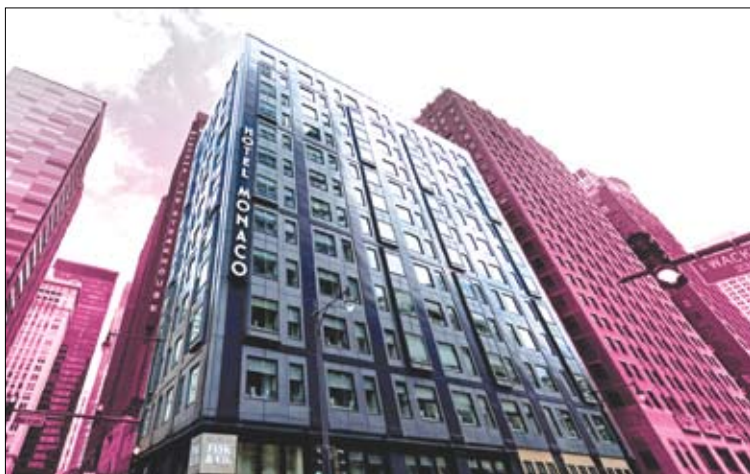
The Kimpton Chicago Hotel Monaco.

Some 51% of the city's hotels are at least 30 days delinquent