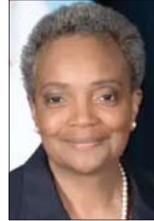
Mayor Lori Lightfoot