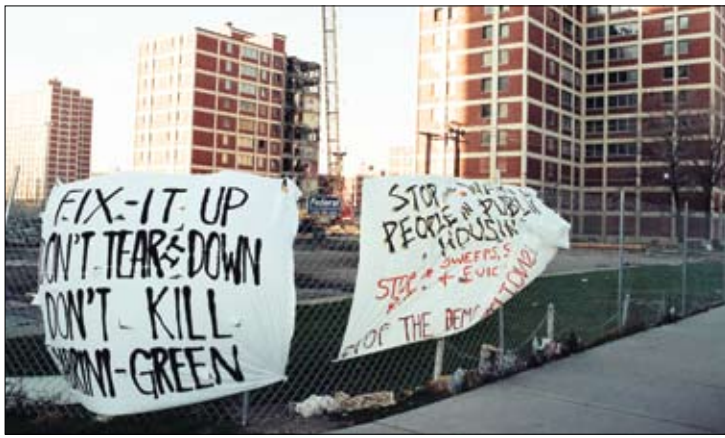
(L) A protest at a Cabrini-Green demolition site Nov. 6, 1995. (R) Mayor Richard M. Daley, right, describes his plan for rehabilitating the Cabrini-Green housing area during a news conference June 27, 1996. Cabrini resident leaders were noticeably absent from the dais.

Fast-forward nearly a quarter century and the dilapidated high-rises are gone, replaced with a well groomed, freshly landscaped new neighborhood that includes an Apple store, a swanky river walk lined with boats and more