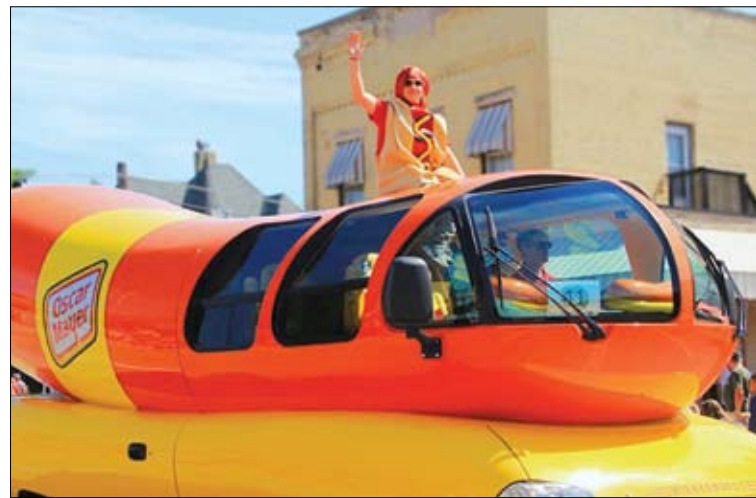
Oscar Mayer Wienermobile is in town now looking for hot dogs to drive their big four-wheeled weiner. Applications close Jan. 31 and will not reopen until next year.

Now I don't know about the Metropolitan YMCA of Greater Chicago finances, but I do know that when the New City development replaced the New City YMCA at 1515 N. Halsted St., the property sold for like $54 million. That Y, disposed of in 2007, was like a tale of two cities -- it not only catered to wealthy Lincoln Parkers but also to the struggling residents of Cabrini Green. Yet when Cabrini-Green toppled so did New City Y membership and Y officials took advantage of the area's red hot prices and sold the