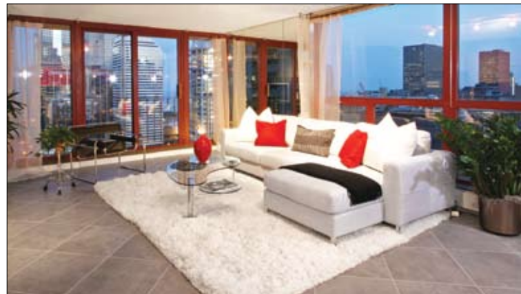
Nicholas Gouletas took this writer on a bicycle ride around the Loop to tour potential office-building conversions. The effort paid off with the purchase, conversion and sellout of the 292-unit Century Tower, an office high-rise at 182 N. Lake St. Later, he purchased the 309-unit high-rise apartment building at 200 N. Dearborn.