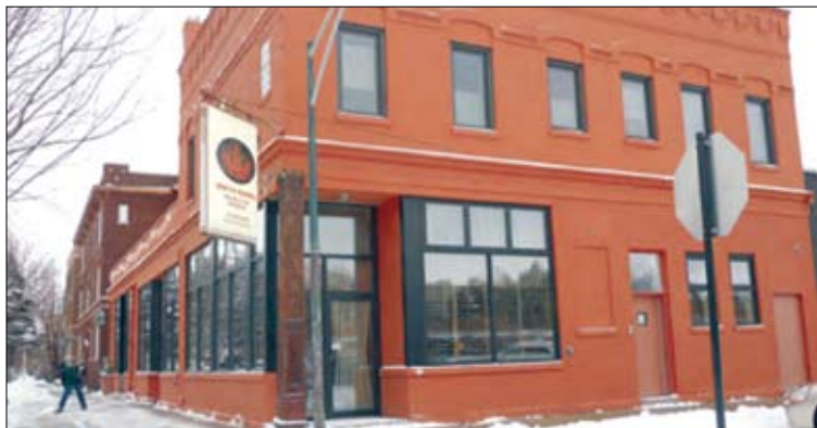
Spacca Napoli Pizzeria, 1769 W. Sunnyside Ave.

In December, Gambero Rosso released their annual Top Italian Restaurants guide for 2021— including their list of best Italian Restaurants in the world. One of 15 top honorees for 2021 is Spacca Napoli Pizzeria, 1769 W. Sunnyside Ave., who in 2017 was also presented Gambero Rosso's Best Pizza in Chicago Award.