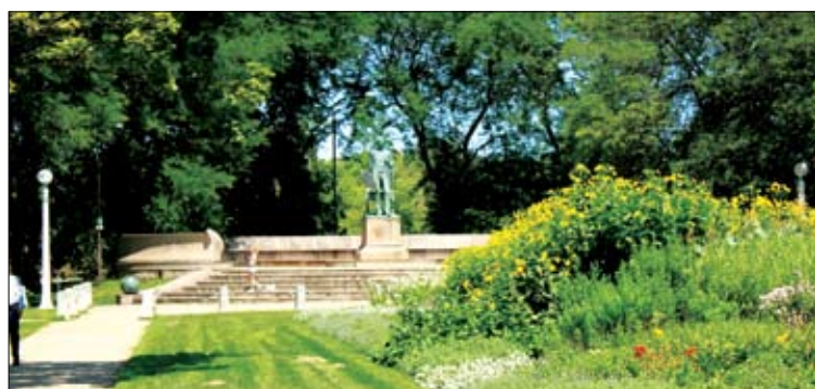
The History Trail around the Chicago History Museum that includes the Lincoln Monument and Gardens are in for future enhancements to Lincoln Park’s southernmost gateway.

Upland Design’s principal landscape architect, introduced two concepts to the 80 attendees. Each design draft offered varied approaches to improving pathways, plantings, and drainage.