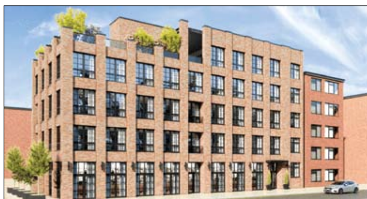
The planned new residential midrise proposed for 2501 N. Clark St.