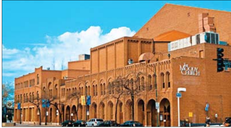
At a meeting held at Moody Church, representatives of developer Fern Hill continue to try and convince the community that their plans to add a large quantity of new density to the neighborhood will not have a crushing impact on the quality of life in historic Old Town.