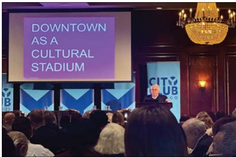
Reimagining Chicago meeting at the City Club, Jan. 14.