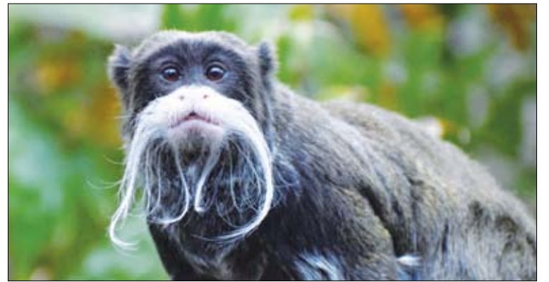
Emperor tamarins are believed to have gotten their name from Kaiser Wilhelm II of Germany, who was well-known for his bushy, upturned mustache.

Some beaches in Indiana have put up signs warning of shelf ice however the Chicago Park District hasn't followed suit.