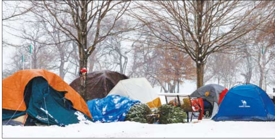
Tents are pictured near Montrose Beach. Dozens of homeless encampments dot the city's North lakefront parks.

But the U.S. Dept. of Housing and Urban Development noted that the number of homeless people also increased in most of the rest of the state, too. The federal report attributed that growth to a lack of affordable housing, increased shelter capacity, extreme cold that brought people into