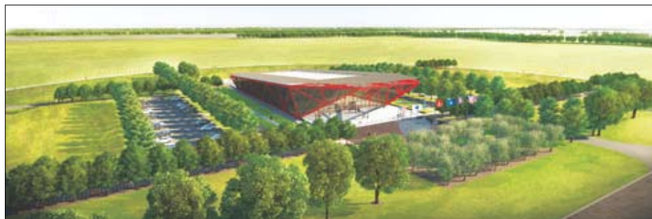
The Somers Village Board unanimously approved plans for the campus in Nov. 2019.

and retired as a lieutenant colonel from the Illinois Army National Guard.