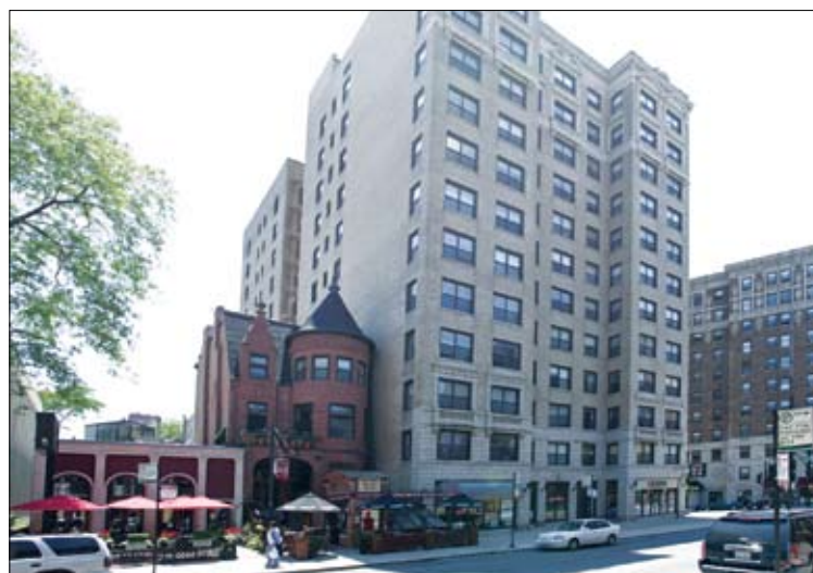
Standard Communities a nationwide affordable housing investor, recently purchased the 145-unit 12-story high rise at 2757 N. Pine Grove. They plan to convert it to 100% affordable senior housing.

The survey is focused on conventional, conforming, fully amortizing home-purchase loans for borrowers who place a 20% down payment and have excellent credit.