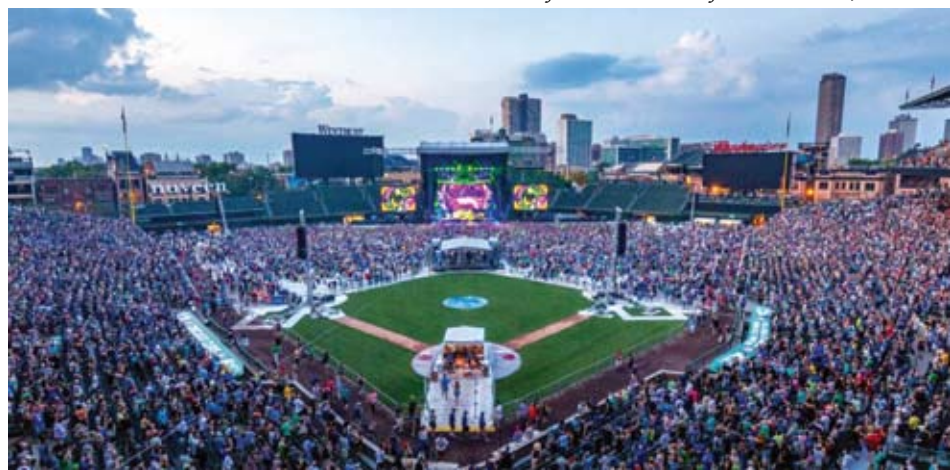
Dead & Company, Morgan Wallen and P!NK will be playing 'ball' in Wrigley this summer.

Submissions can be sent to Ward50@cityofchicago.org .