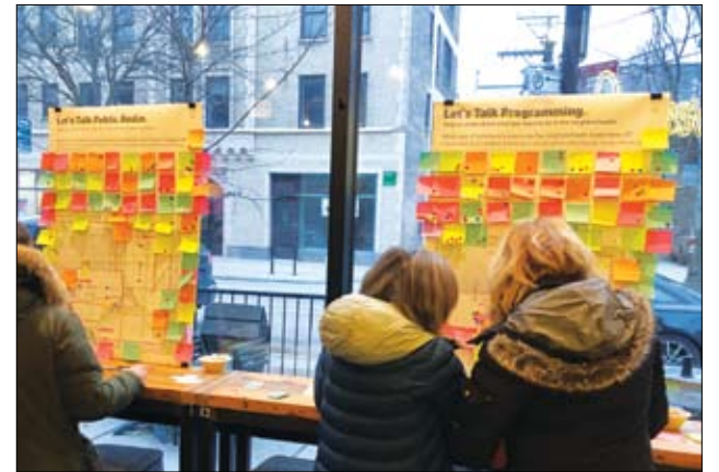
While a wish list of public plazas and events were presented, one idea that did not get much attention was a proposed expansion of the a Special Service Area taxing district into Roscoe Village.