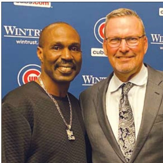
Shawon Dunston and Mark Grace.