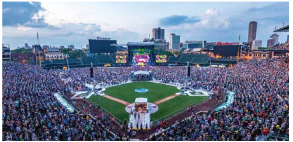
Dead & Company, Morgan Wallen and P!NK will be playing 'ball' in Wrigley this summer.

Submissions can be sent to Ward50@cityofchicago.org .