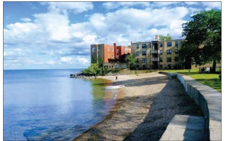
Rogers Beach Park, 7705 N. Eastlake Terrace.

The proposed study area includes Chicago's entire shoreline. As a part of the study, the Corps will explore various measures that could be implemented along our shoreline to reduce coastal storm risks. These measures include breakwaters, seawalls,