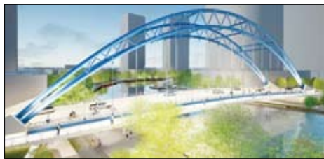
The Dominick Street Bridge will be part of a new North/South roadway crossing the river.

The new bridge will be 80' wide, including automobile roadway in each direction, 10' sidewalks on either side and a single 10-foot two-way bike lane on the east side of the bridge. The bridge is expected to cost $35 million.