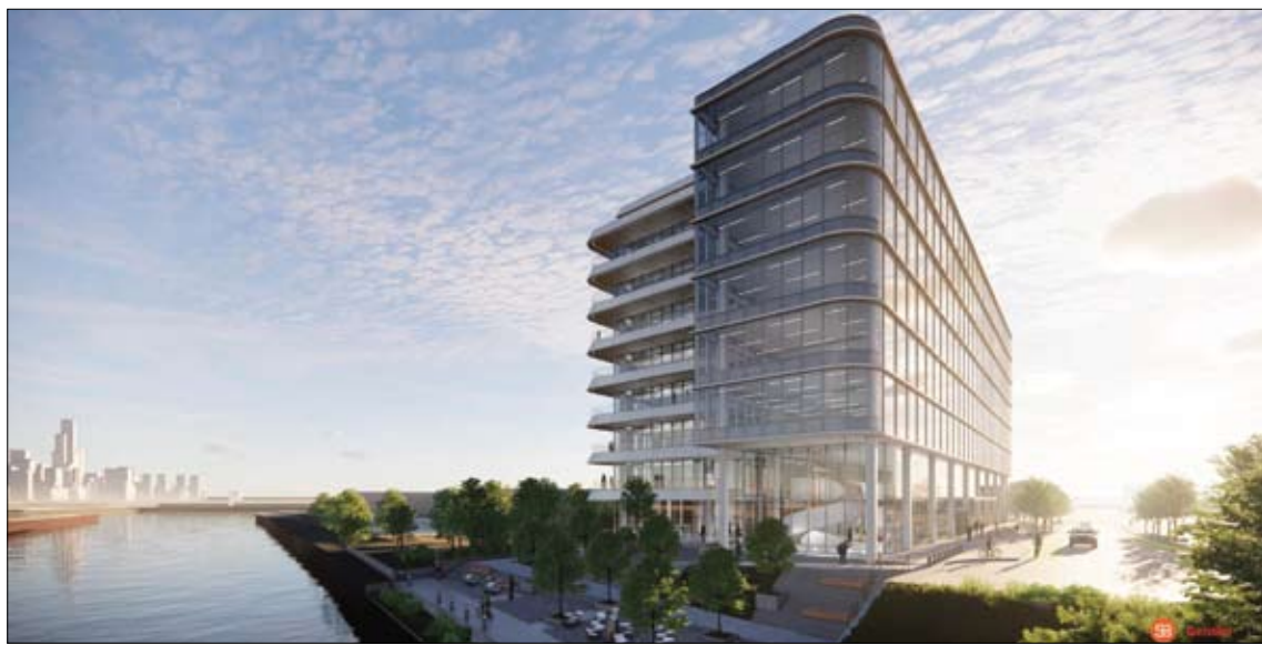
The proposed new Life Sciences building.