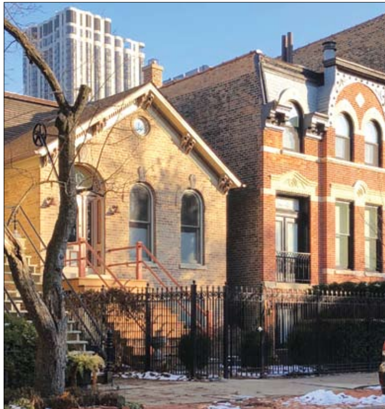
A COVID-19 Tax Relief ordinance pushed back the deadline for paying the first installment of property taxes this year to May 3, from March 2. The second installment of taxes will be due on Oct. 1, instead of Aug. 2.

In Chicago, the COVID-19 assessment-value reductions average 10%. They range from about 7.5% in Lincoln Park, Lakeview and Uptown, and nearly 8% in the Loop, River North, Old Town, South Loop and Bronzeville. The reductions are about 9.5% in Rogers Park and West Ridge, and range as high as of 12% on Chi-