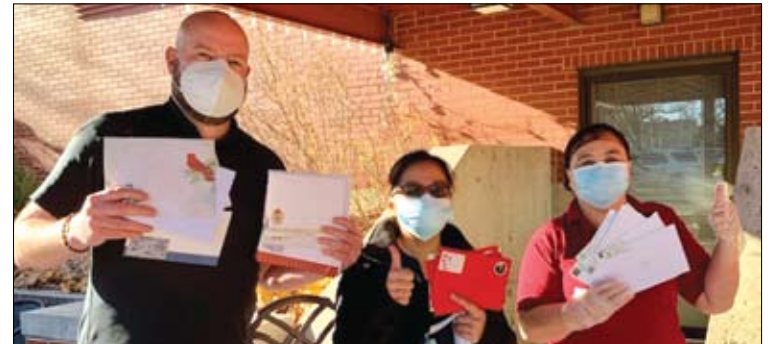
Staff at Chicago Methodist Senior Services distributed about 500 holiday cards to its residents in Wesley Place, Hartwell House and Covenant Home from Edgewater Village Chicago volunteers.