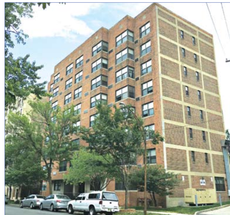
Levy House, 1221 W. Sherwin