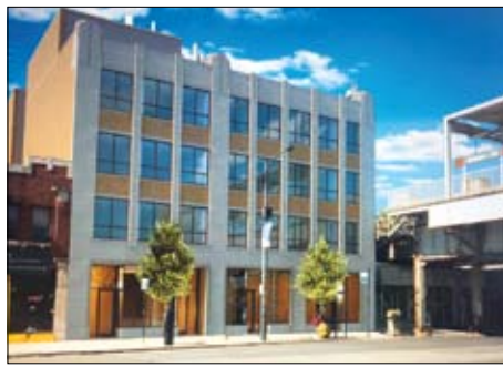
4640-4644 N. Western Ave.

Most afternoons, the stretch of Western Ave. from Wilson Ave. north to Foster is horribly congested. Building a large grocery store at Lawrence Ave. with the 2500-plus cars, CTA buses and delivery trucks it may draw daily would exacerbate that