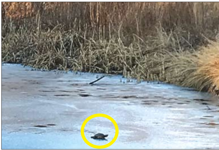
Bowzer the turtle was rescued recently from Indian Boundary Park in West Ridge.