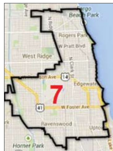
Boundaries of the 7th District.

At 1 p.m. Saturday, Feb. 6, the Democratic party insiders will meet at the Swedish American Museum, 5211 N. Clark St., for the purposes of reviewing candidate credentials, interviewing candidates, and voting on the appointment to fill the senate vacancy. Due to the declared public