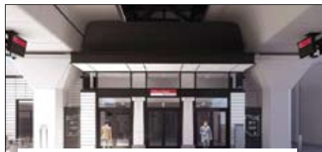
New Bryn Mawr station rendering

The CTA will open at that time temporary stations at Bryn Mawr and Argyle to provide Red Line access to riders. All four new stations are due to reopen by the end of 2024, when all of the station houses and platforms will be ADA accessible, and may will feature public art installations by local artists.