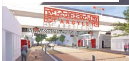
New Argyle station rendering