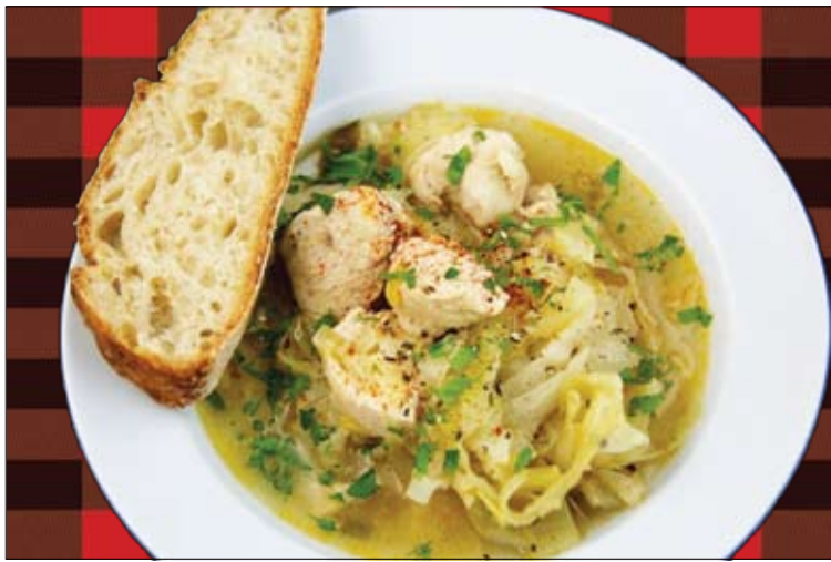
Making comfort food while the winter snows fly.

Hard to believe that we are five weeks into 2021. I approach this new epoch of time, despite the pandemic, with hope and trust in the better days ahead. The harmony of my present surround-