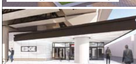
New Berwyn station rendering