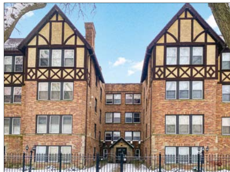
2641 W Estes Ave. in West Ridge.

just faced with," said Logarakis. "At $141,250 a unit, this is a high price-per-unit for the product type and provides an investor the opportunity to increase rents on units that are below market through improved management and light renovations."