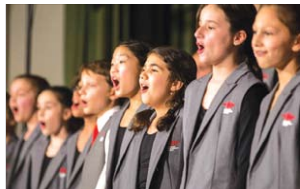
Chicago Children's Choir