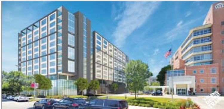
This 314-unit courtyard-style building [above] would go up at the corner of Marine Dr. and Wilson Ave., and include 136 parking spaces, a bike room and a rooftop deck, but no first floor retail space.

The proposal came with a good bit of suspicion by community residents and public officials who feared the plan was to close the