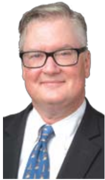
By Jack Lydon