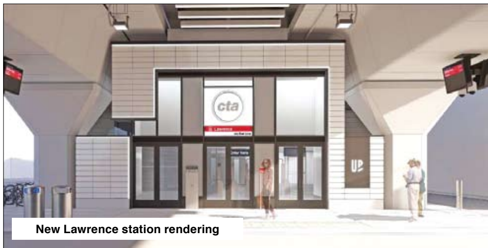
New Lawrence station rendering