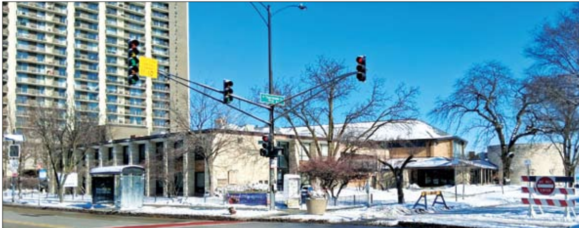
Emanuel Congregation, 5959 N. Sheridan Rd., with Malibu Condominium building on the left.

Property tax benefits to city unlikely despite assurances: RPM TIF will take the cash