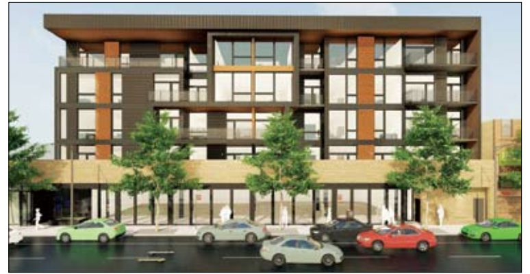
Artist rendering of 4511-13 N. Clark St.