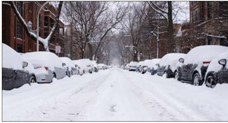
After the recent snow in Chicago, one wonders if Mayor "Snowplow" Johnson was even familiar with the winter's most necessary of vehicles, and the peril of a Jan. 1979 blizzard that totally shut Chicago down.

Byrne went on to win the general election with a record-setting 82% of the vote, becoming Chicago's first female mayor. Assisted by the avalanche of Chicago snow she became our 50th Mayor