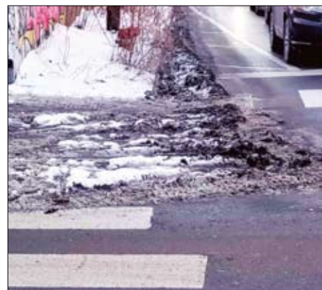
Crosswalk, 6200 Block of N. Ridge Ave.

It’s not only pedestrians, especially those using assistive devices, whose safe use of this crosswalk is being impeded by City refusal to plow it. After I took these photos, I saw a person on an e-bike riding east across this intersection - on the north side of the raised island. He too had seen the freezing slush at the west end of the protected bike lane, and wisely decided to use the plowed pavement in the cars-only lane. Fortunately, there were no westbound cars approaching then; but had there been,