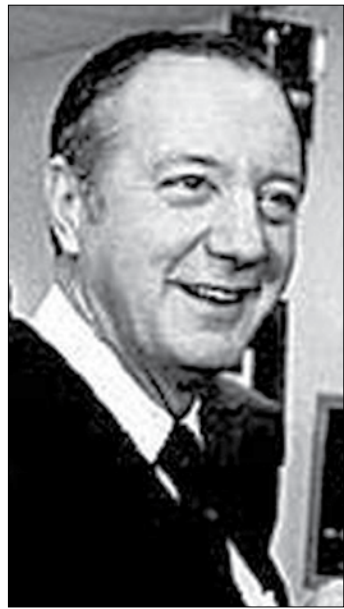
Former mayors Michael Bilandic and Jane Byrne.

Bilandic oddly decided to run for the Mayor's Office in the Primary election of 1979. But Chicagoans' anger resulted in payback to his career. Confounding Bilandic's troubles, Jane Burke Byrne set her sites on his office for her-