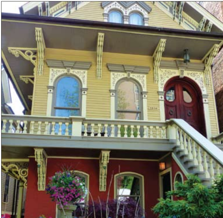
Lincoln Park Wacker House.

On Jan. 30, President Donald Trump announced that he will nominate former Fed official Kevin Warsh as the next Federal Reserve Board chief when current