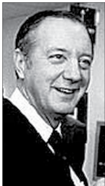
Former mayors Michael Bilandic and Jane Byrne.

Bilandic oddly decided to run for the Mayor's Office in the Primary election of 1979. But Chicagoans' anger resulted in payback to his career. Confounding Bilandic's troubles, Jane Burke Byrne set her sites on his office for her-