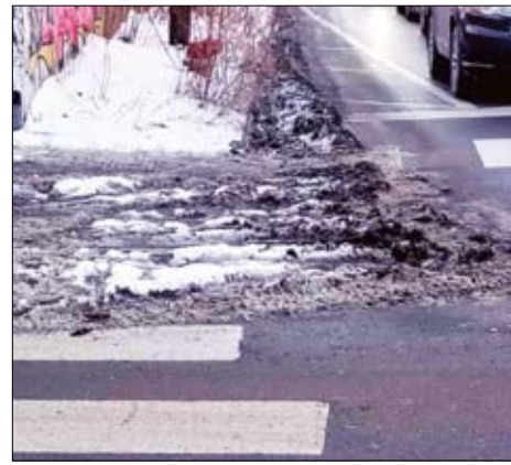
Crosswalk, 6200 Block of N. Ridge Ave.

It's not only pedestrians, especially those using assistive devices, whose safe use of this crosswalk is being impeded by City refusal to plow it. After I took these photos, I saw a person on an e-bike riding east across this intersection - on the north side of the raised island. He too had seen the freezing slush at the west end of the protected bike lane, and wisely decided to use the plowed pavement in the cars-only lane. Fortunately, there were no westbound cars approaching then; but had there been,