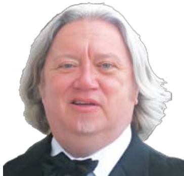
By Thomas J. O'Gorman

As long as I can remember, following a walloping of heavy snowfall, the mayors of Chicago with any brains have Streets and Sanitation carting away the fluffy white stuff. The original Mayor Daley could catch the flakes before they hit the streetscape.