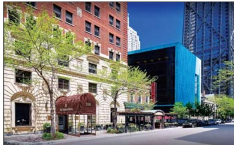
The former Tremont Hotel, 100 E. Chestnut St, was just sold for $13 million.