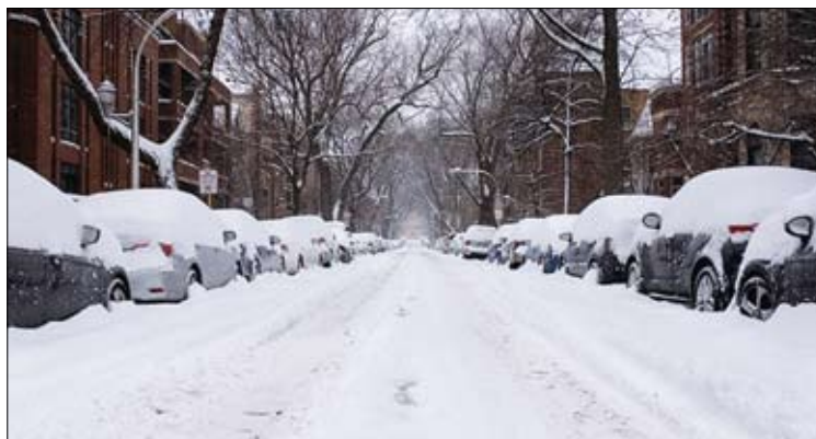
After the recent snow in Chicago, one wonders if Mayor "Snowplow" Johnson was even familiar with the winter's most necessary of vehicles, and the peril of a Jan. 1979 blizzard that totally shut Chicago down.

Byrne went on to win the general election with a record-setting 82% of the vote, becoming Chicago's first female mayor. Assisted by the avalanche of Chicago snow she became our 50th Mayor