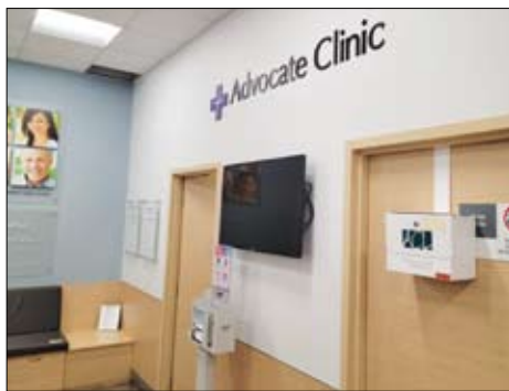
Advocate Clinic inside Walgreens, 5625 N. Ridge.

Previously, Advocate Medical Group closed seven of its clinics in Walgreens stores in Feb. 2020. After the current closures, Walgreens noted that patients can see doctors or nurse practitioners through