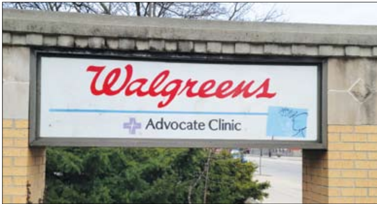
Advocate Clinic at Walgreens, 5625 N. Ridge.

817 Grace St. 773-525-8480 FREE INDOOR PARKING OAUWCCChicago.org