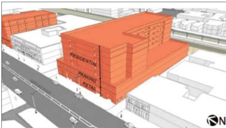
CTA concept for 5625 N. Broadway (former site of Northside Toyota).