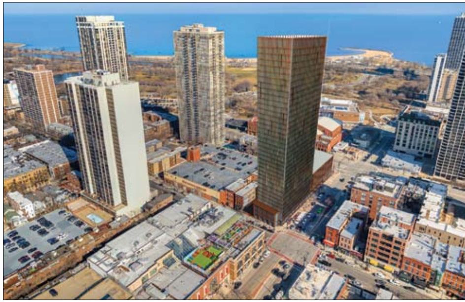
Rendering of the proposed Fern Hill high-rise project at North Ave. and LaSalle St.

There was no mention at any of the community meetings of the Chicago Housing Authority’s [CHA] plan to build a whopping 4,080 affordable units just a few blocks south of North Ave.