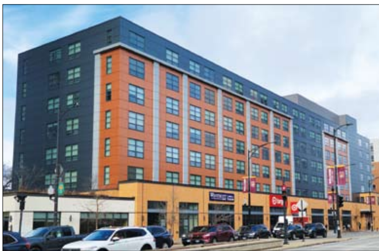
6418-22 N. Sheridan Rd.

The seven-story building includes 65 units reserved as affordable for CHA residents while the remaining 46 units will be