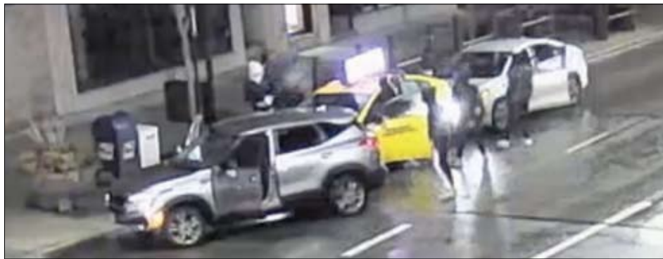
Armed men rob a taxi driver in the 5900 block of N. Broadway on Jan. 30.

They started their crime spree around 3:30 a.m. in the 2000 block of W. Granville. After that, they struck again in the 2100 block of W. Lunt, the 6600 block of N. Clark, the 6100 block of N. Wolcott, and the 2000 block of W. Farwell.