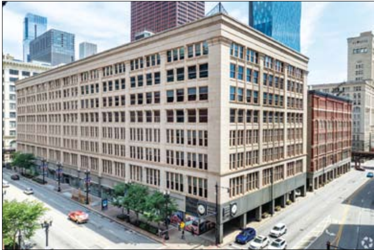
401 S. State St.