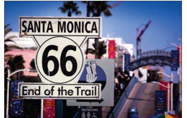
(L) Route 66 marker near Michigan and Adams in the Loop. (R) Route 66 "End of the Trail" sign at Santa Monica Pier.

America's 'Mother Road' has a new beginning. Formally linking the Great Lakes to the Pacific, the Chicago City Council passed a resolution designating Navy Pier as the official starting point of historic Route 66.