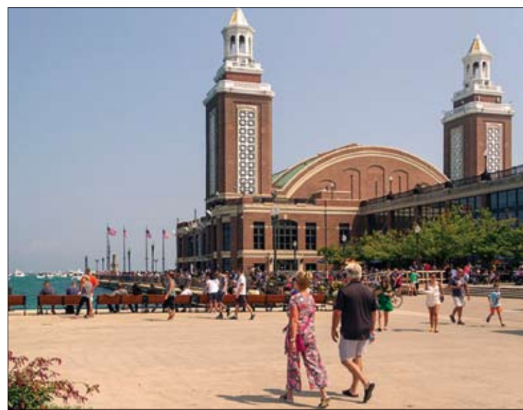
People and boats wait for a Chicago Air and Water Show near the northeast corner of Navy Pier

"It is the Newberry's mission to make its collection materials available to all, and we are so excited that the Mellon grant will greatly expand access to these resources."