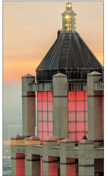
Unauthorized young urban climbers were seen atop 900 N. Michigan Ave. on Feb. 15.