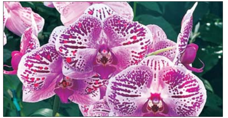
Illinois is home to 50 species of orchid. Sixteen of these species are listed as endangered and two are listed as threatened.

During the show, the botanic garden's Lenhardt Library is exhibiting Slipper Orchids: Retro,