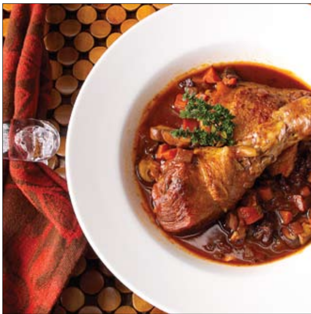
A dish of coq au vin (L) and the window of Chez L'ami Louis.

But now an atomic advancement is underway with the medical leaps unleashed with the latest pharmaceutical miracles. These prescription medications like Ozempic, Mounjaro, Zepbound and Wegovy lift the overweight and the worried, changing the way Americans re-take control over their health.