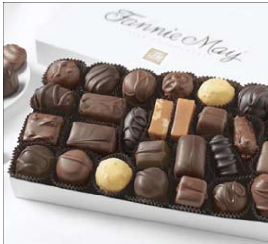
Visitors who often brought a box of Fannie Mae's to us were family favorites.

more recent times. And independent gourmet candy shops still dot the city street maps. But none of it is cheap.