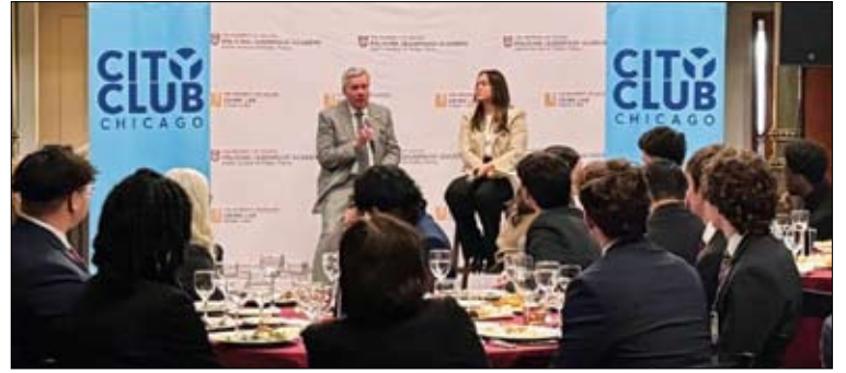
R. Gil Kerlikowske speaks to the City Club at The Library.

economic issues and impacts on immigration. Kerlikowske highlighted the essential role that immigrant labor plays in the American workforce, noting, "We need these people in the country. We need that work. If you're in South Carolina in the middle of summer, look who's working on a roof in 100 degrees or 110 degrees. They don't take jobs from Americans."