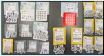
Photos show some of the counterfeit stamps seized over the weekend in Chicago.

U.S. Customs and Border Protections [CBP] officers assigned to the Anti-Terrorism Contraband Enforcement Team at the Chicago International Mail Branch stopped eight shipments containing a total of 161,860 counterfeit U.S. Forever stamps they announced on Feb. 13.