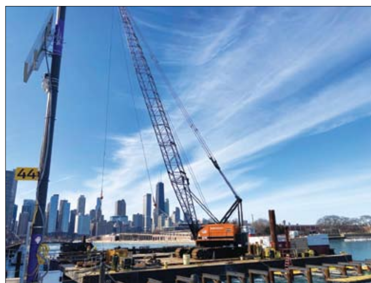
Permanent, floating docks are being installed at Navy Pier.