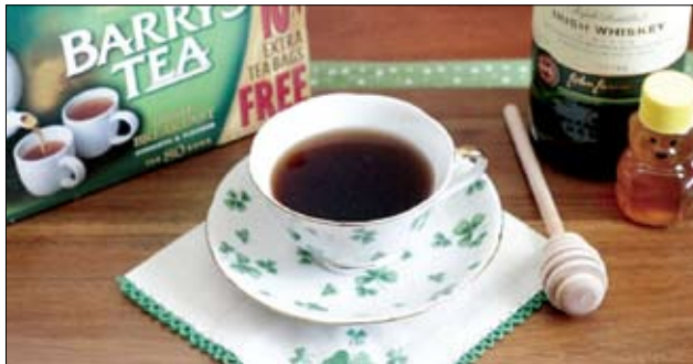
Getting the tea down was the essential miracle drug that broke fevers, aches and pains, scrapes, cuts and bruises.

The out-of-control financial intelligence of low grade, would-be political leaders only digs an urban pathway of crumbling destruction. Injecting missed opportunities