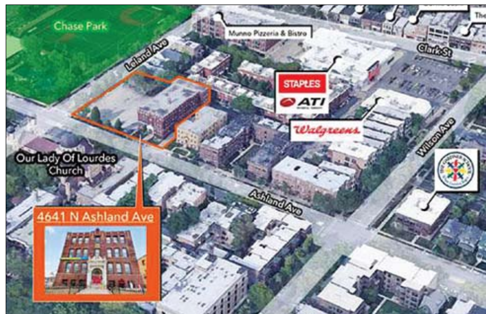
The sale of the former school building and adjacent parking lot located across the street from the Church of Our Lady of Lourdes, at 4641 N. Ashland Ave., seems to have contributed to the upcoming closure of the church building itself.

"Our Lady of Lourdes is a large church and can accommodate many worshippers. Historically, attendance at many Sunday Masses was rather low, and therefore, with limited priest help between the two worship