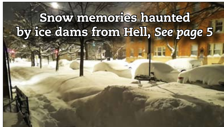
Snow memories haunted by ice dams from Hell, See page 5

According to CPD, the suspects are two Black men between 18- and 25-years-old who stand 6' to 6'-2" tall and weigh 150 to 160 lbs. The men wear dark hoodies, jeans, gloves, masks, and one wears a white hat. And, of course, there's the yellow backpack.