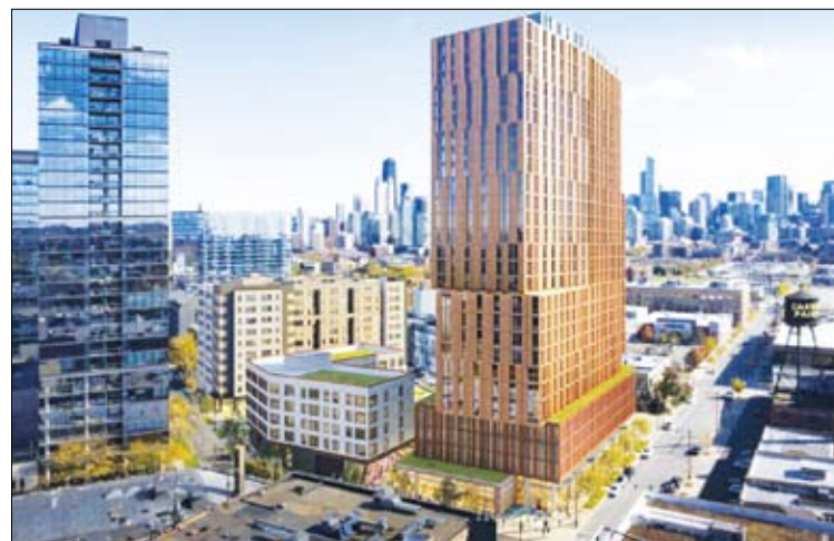
The Park at Big Deahl, 1450 N. Dayton. Image courtesy GREC Architects

If your block has potholes that need to be filled, whether they're new or left over from the winter of 2019-20, call your local ward office or City Hall [dial 3-1-1] with the addresses where the potholes exist. Be sure to include the exact address(es) that the potholes are in front of, rather than just a block number.