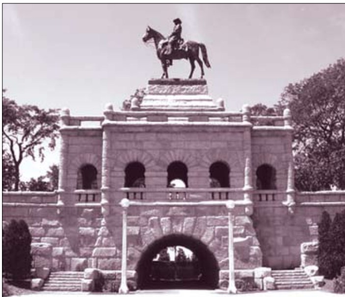
Forty one monuments, sculptures, commemorative plaques and artworks on the public way in Chicago - 27 on the North Side - are now being considered for cancellation by City Hall bureaucrats and social justice activists.