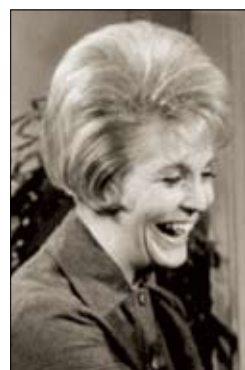
Lee Phillip Bell