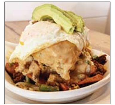
The RP Strong Biscuit.