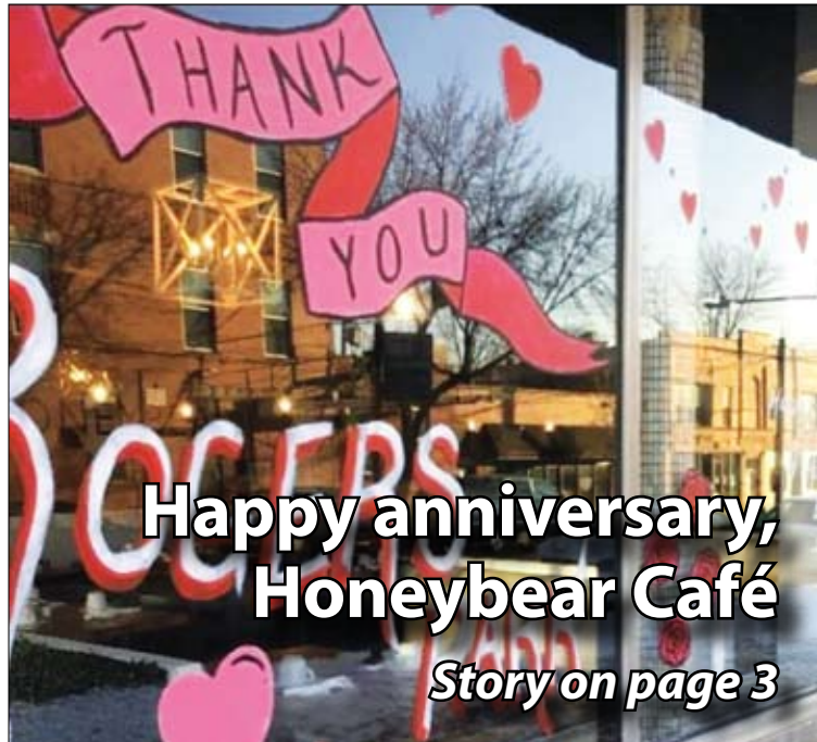
Happy anniversary, Honeybear Café Story on page 3