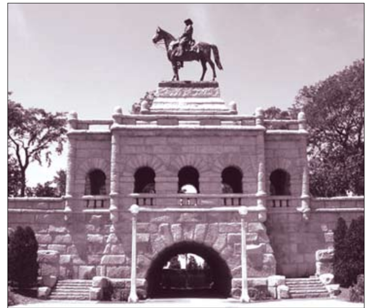
Forty one monuments, sculptures, commemorative plaques and artworks on the public way in Chicago - 27 on the North Side - are now being considered for cancellation by City Hall bureaucrats and social justice activists.