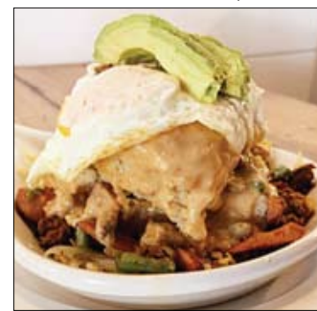
The RP Strong Biscuit.