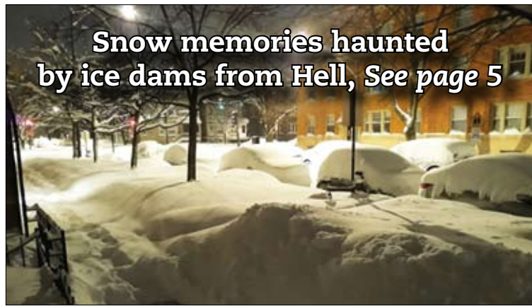
Snow memories haunted by ice dams from Hell, See page 5