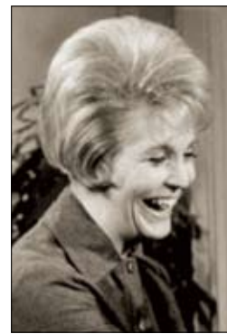
Lee Phillip Bell