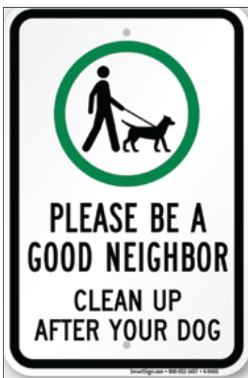
Please clean up after your dog.

Before she starts working on designing the mural specifics, Costello is seeking feedback through an online survey from local residents about what some favorite spots and activities are in the area. To participate in the survey, call the chamber of commerce at 773-728-2995.