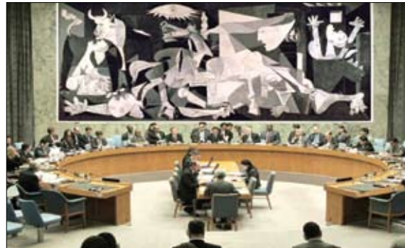
Guernica tapestry formerly at U.N.