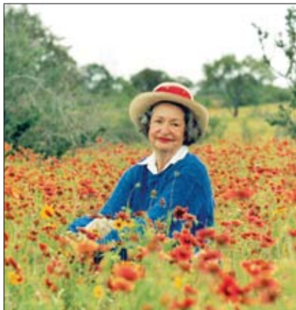
Lady Bird Johnson

Shelley could crack that Chitown code. As mysterious as Mayor Lightfinger's uniforms.