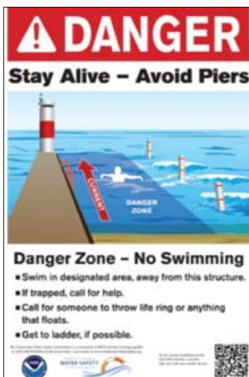
Residents of the 49th Ward can vote until Friday for bi-lingual safety signage on their beaches.