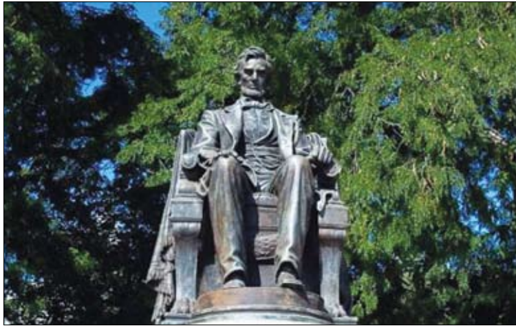
The seated President Abraham Lincoln sculpture in Grant Park.

Meeting via Zoom does not allow a similar back and forth exchange and does not have the same amount of transparency. This newspaper has been hearing many complaints about the opacity of Zoom-only meetings where