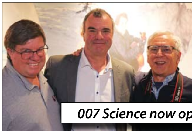
007 Science now open