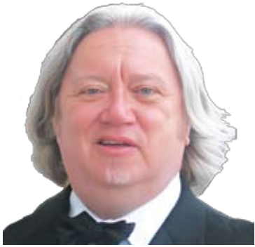
By Thomas J. O'Gorman

Winter winds and blinding sleet, freeze land and water reed. The last vestige of village life and sea grass to get eaten. Celtic tribes pursued vast reaches of empty tracts in the hopes of finding country vittles, neither racked nor ruined. "The perfect crust we feast."