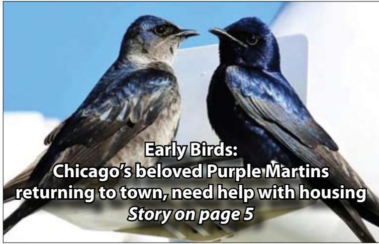
Early Birds: Chicago's beloved Purple Martins returning to town, need help with housing Story on page 5