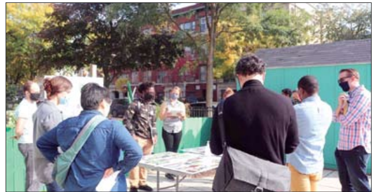
Residents look over proposals for a city-owned lot at Howard St. and Ashland.

demolition and rebuilding of the third floor, full addition of a fourth floor, the installation of two new elevators, all new mechanical systems, extensive masonry work for new window openings and full interior build-out.