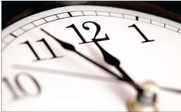
Time will be a critical commodity in the upcoming mayoral election and we're gonna need plenty of light to make it through.

March 10 was the day to change the clocks but some folk are still catching up. We reverse the process on Sunday, Nov. 3. It's a time honored tradition, though apparently a growing number of states are choosing to take a pass on the changing of the clocks. Californians actually voted for