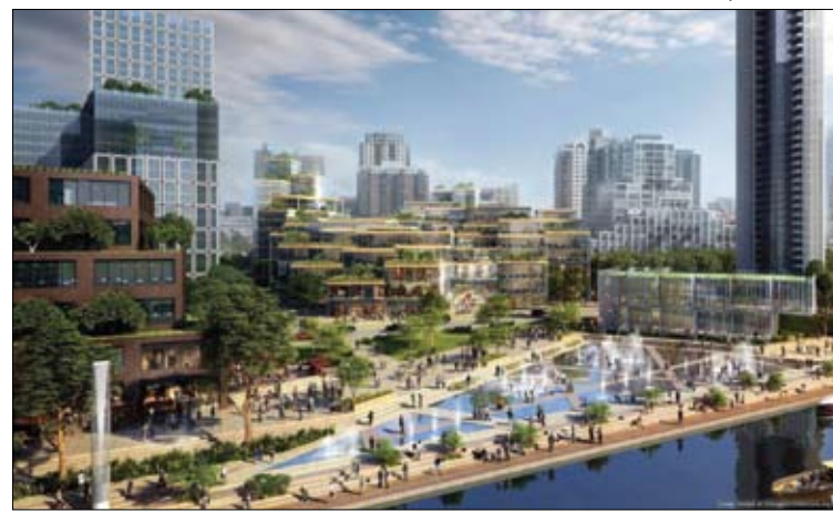
The 78 is a $5 billion mixed-use project intended to fill the gap between the South Loop and Chinatown.