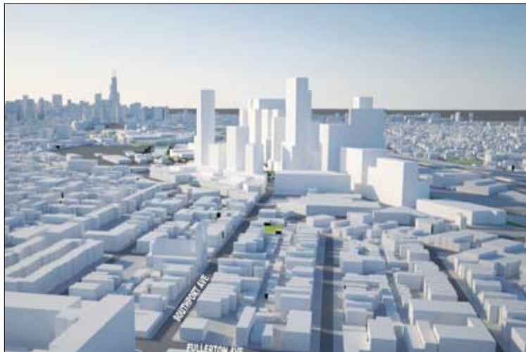
Critics claim Lincoln Yards’ overwhelming bigness would loom over the delicately scaled surrounding communities.

Rapid development in and on the southern border of Old Town, where mid-rise apartments now are sprouting on North Ave.