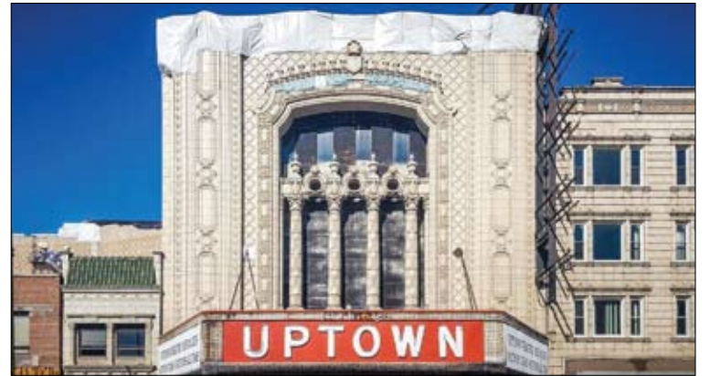
The Uptown Theater, designed by architects Rapp and Rapp for operator Balaban and Katz Corp., will get $13 million in TIF funds to help rehab the landmark property.