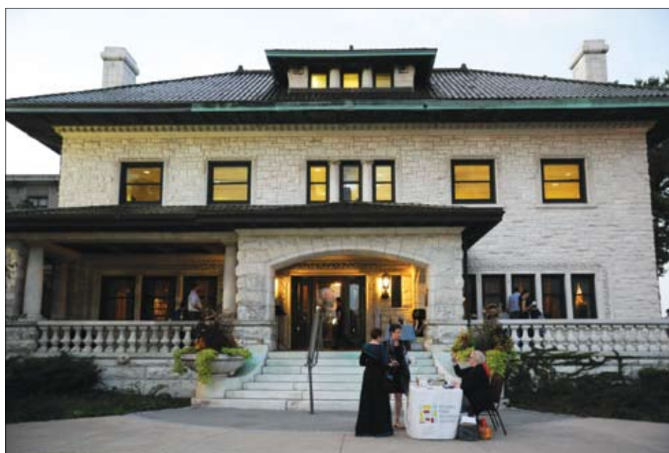
The magnificent lakeside Piper Hall mansion will be the site of Sneak Peek, a March 28 benefit for the Rogers Park Business Alliance.