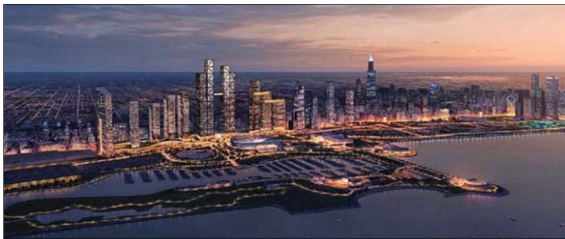
The new One Central development in the South Loop was just announced last week.