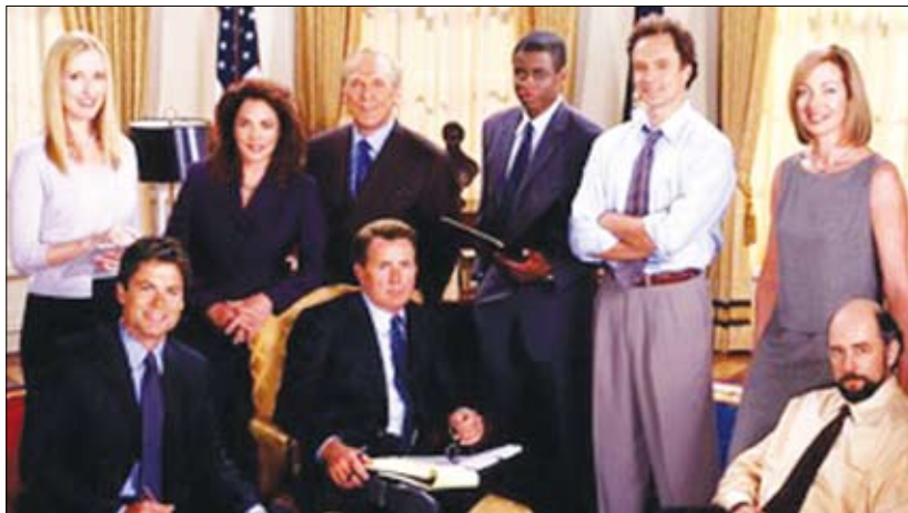
(Left) President Bartlett and Staff. (Right) President and Mrs. Francis Underwood.

This is more like a modern update of the Borgias than our Aaron Copeland presidency of West Wing, where everyone has a moral conscience. My anxiety kept rising as I was forced to lessen my House of Cards viewing in season