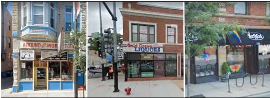
Burglars took ATMs from Around The World Tobacco; Gold Crown Liquors, and the North End bar.