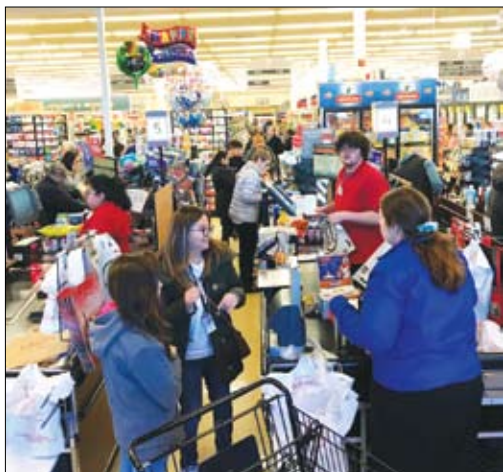
People forced to be home 24/7 are now going through home stress tests.