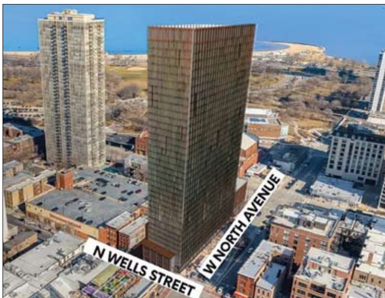
Developers Fern Hill hosted an online virtual community meeting March 21 regarding the proposed high-rise at 1610 N. LaSalle Dr.