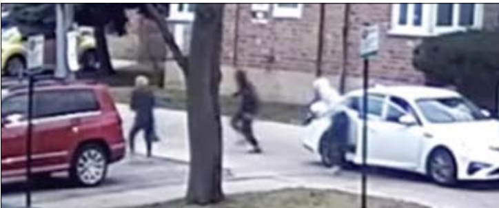
A frame from surveillance video shows two men preparing to rob a woman in West Rogers Park on Feb. 21, 2024. CPD said the crew committed nine robberies in about 45 minutes that morning.

CPD said the group committed robberies that morning in the 3400 block of W. Waveland at 6:30 a.m.; 3100 block of W.