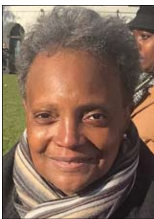
Former mayor Lori Lightfoot.

Meanwhile expanding the bread and circuses of the summer's entertainment. Of course nothing permits the inept and shameful handling of urban crime more than the idiocy of woke political leadership with little loyalty and meagre intelligence. This is Mayor Lori all over again, on steroids. Poor Mayor