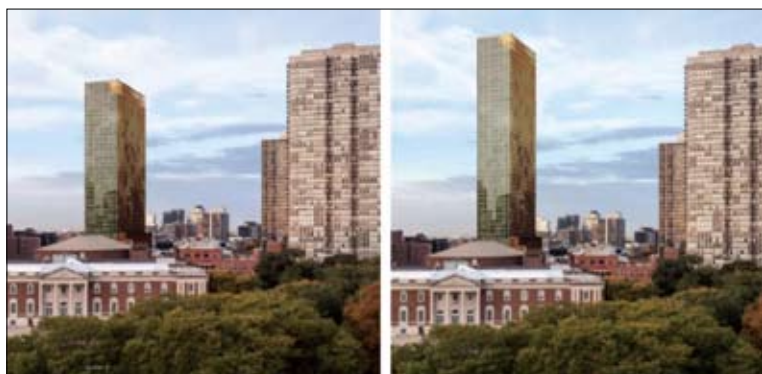
Plans (above) for 'Old Town Canvas,' the proposed high-rise at 1610 N. LaSalle Dr., show that it has narrowed, while gaining an additional 85' of height. The building will add 500 new units to the area, but will provide parking for only 150 cars.

North, but will provide only 150 parking spots for the building's residents (with an additional 300 spaces for the exclusive use of Moody Bible located across the street).