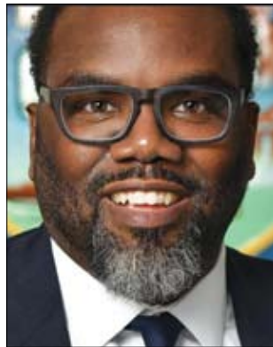
Mayor Brandon Johnson

Lori's brilliant one term as mayor. This ill-equipped crew's response and lackluster emotion is, of course, a disgrace. This administration now reeks of the fragrance of funerals. Their politics carry the lazy man's burden for lack of purpose and responsible reaction. Hello Stockholm.