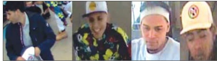
CTA surveillance images released by Chicago police show the robbery suspects.