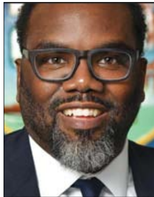
Mayor Brandon Johnson

Lori's brilliant one term as mayor. This ill-equipped crew's response and lackluster emotion is, of course, a disgrace. This administration now reeks of the fragrance of funerals. Their politics carry the lazy man's burden for lack of purpose and responsible reaction. Hello Stockholm.