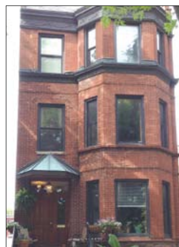
"Well-located income properties returning high rents are extremely attractive to small investors," Sara Benson said. "It's about cash flow, scarcity, and demand."

• In 2017, zip code 60647 posted sales of 46 three-unit properties for an average price of $582,050. Average market time was 83 days. Twenty-six four-flats in the 60647-zip code sold for an average price of $774,230 in 2017 with an average market time of 50 days.