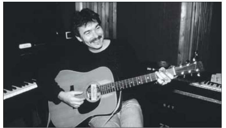
John Prine in the recording studio rehearsing for the following night’s Steve Goodman Tribute concert.

No tax credits for Lincoln Square housing project, Story on page 5