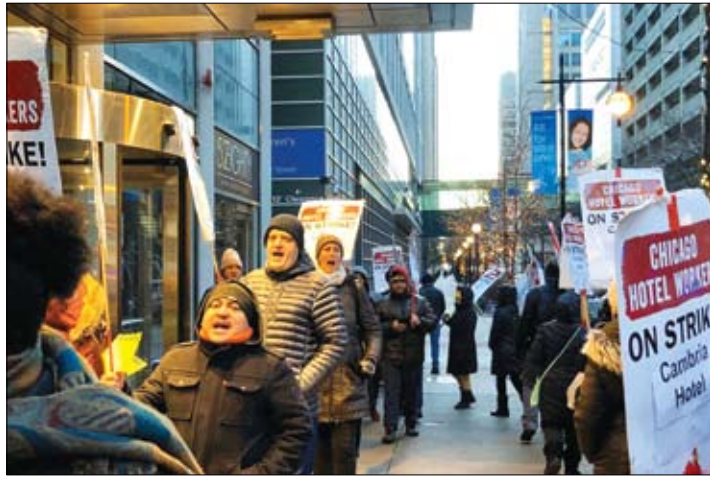
Unite Here Local 1 strikers in front of the Cambria in Dec. 2019.