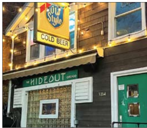
The Hideout, 1354 W. Wabansia Ave.