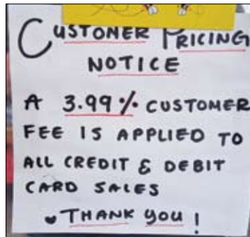
Swipe fee advisory signage in an Edgewater eatery.

But Toast, a large supplier of POS systems in Chicagoland, say