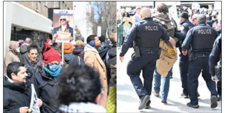
Several North Side non-profits and Non-Governmental Organizations organized a "No Kings" protest last weekend in multiple locations across the city, including in Lake View, Edgewater and Rogers Park.