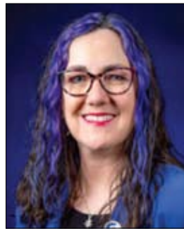
Rep. Kelly Cassidy [14th]

It also bars the Secretary of State from providing facial recognition search services except when issuing a mobile driver's license or identification card. That facial recognition database is the most commonly used within CPD.