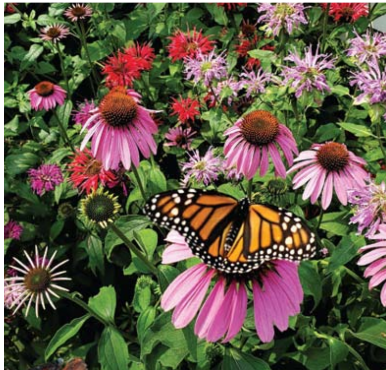
Native managed pollinator gardens created in home gardens are self-sustaining. They are a low-maintenance option for our gardens.

The new ordinance requires DSS to establish and maintain a registry of managed native and pollinator gardens, without cost to its registrants. The DSS may promulgate rules regarding standards and processes associated with the establishment and maintenance of, and inclusion in, the registry of such gardens that are pollinator-friendly and that do not have plants encroaching on sidewalks or extend beyond the property line.