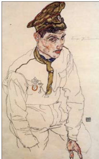
Egon Schiele, Russian War Prisoner (1916)

When you make amends, you go further than just saying "I'm sorry." You acknowledge your errors, then take action to make up for what has happened in the past. Returning the stolen art can