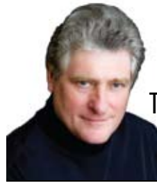
The Home Front by Don DeBat

The is the second of two articles on changes in real-estate brokerage commissions.