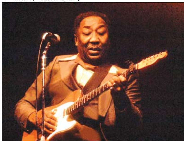
Blues artist Muddy Waters.

So far, Chicago police have not announced any descriptions of the suspects.