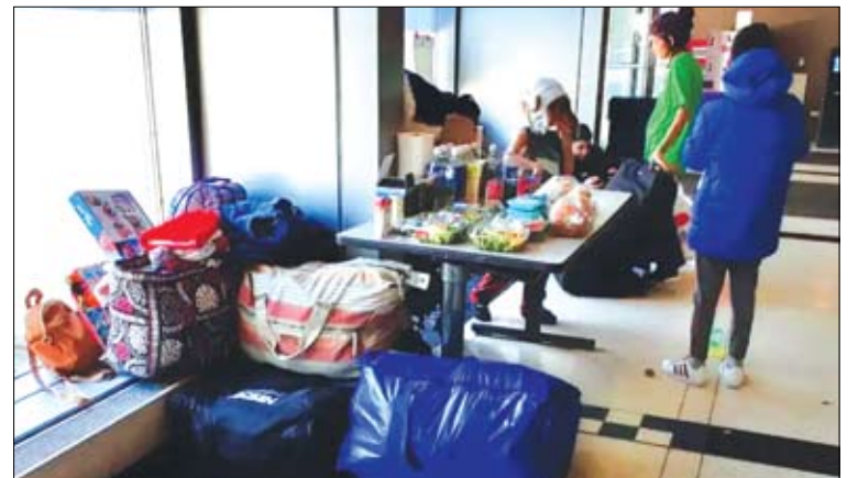
A small table in the police station lobby holds bottled water, snacks, and salads for the families.

During the day, random shoes litter the police station lobby