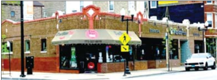
Common Pantry's new home at 3744 N. Damen Ave.