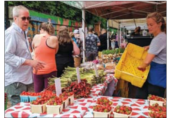
Some 40,000 shoppers were served at the Glenwood Sunday Market during 2023. It raised $34,000 for food accessibility programs and brought $4.7 million into the neighborhood, according to Rogers Park Business Alliance.