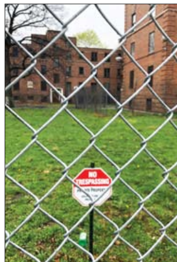
CHA fencing has not stopped taggers or squatters.

While a new apartment building was added, work on the rest of the campus has stalled. All unoccupied residential units remain surrounded by eight-foot-tall chain-link fences. While entry is prohibited, signs of frequent trespassing and illegal activity are everywhere. Broken windows are visible on all buildings and