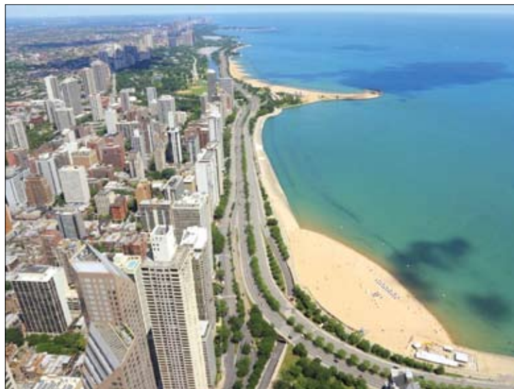
Wise leadership can harness the sea, and neighborhood by neighborhood harvest the bounty of the Prairie.

Chicago, it is important for all of us to recognize what a great city can still accomplish under the reason and intelligence of wise leadership. In the end, wise leadership can harness the sea, and neighborhood by neighborhood harvest the bounty of the Prairie.