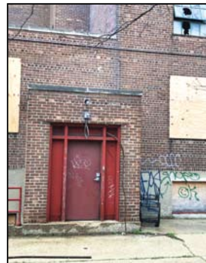
The Chicago Housing Authority and its operating partners Related Midwest, Heartland Housing and Bickerdicke Redevelopment are now pointing fingers at each other over who is to blame for the lack of security and current state of the Lathrop Homes property along Clybourn Ave.