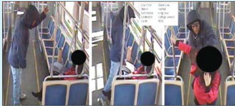
CTA Surveillance video image of assault.

A man who's on parole for three felonies boarded a Green Line CTA train at the Roosevelt station and then robbed and tried to sexually assault a female tourist who was on the same train car this month, prosecutors said April 9.