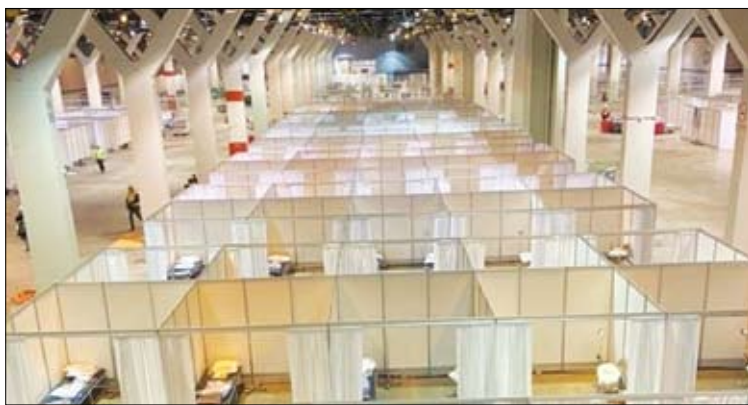
Once the pandemic passes, let’s turn those 2,250 new hospital beds at McCormick Place into homeless housing.

As of April 12, 2,772 hospital beds were filled by COVID patients in Illinois, while another 11,366 beds were open and available. The state projects Illinois resource needs for beds peaked last week. In all, Illinois is expected to have 4,883 more hospital beds than the state’s projected needs. Those numbers do not include the 2,250 new beds in McCormick Place. So that space may no longer need to be used as an emer-