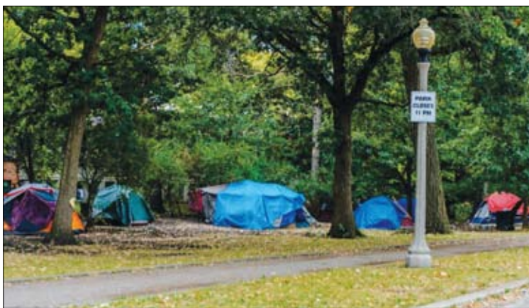
Tent city in Gompers Park, 4222 W. Foster Ave.