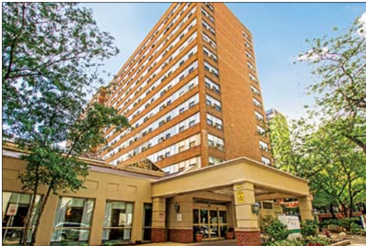
Brookdale Lakeshore, 3121 N. Sheridan Rd., will not be renewing their lease.