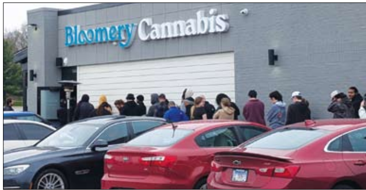
People were lined up around the buildings of seven dispensaries, parking lots overflowing, for better priced marijuana products.

The trickle-down effect on the local economy is evident too. Any carpenter, framer, drywall, tiler or parking paver who needs work is finding it in Southwest Michigan. Frankly, what they may need most of all right now are a