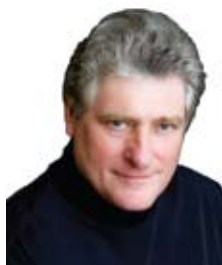
by Don DeBat

This workshop covers the fundamentals of savings, investments, and risk management. Engage in practical exercises, gain expert insights, and leave with a clear action plan to navigate your financial journey towards stability and prosperity. The meeting is open to the public.