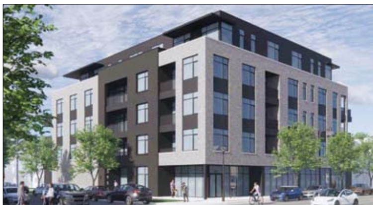
This new high density mixed-use property is proposed for North Center, and will provide 37 new residential units but only create 16 parking spaces.

Developed by Altitude Capital Partners, the project site is located at the southwest corner of W. Irving Park Rd and N. Seeley Ave. where a small strip mall ex-