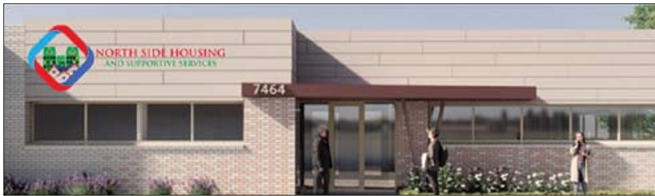
Construction has begun on a new Rogers Park men's homeless shelter at 7464 N. Clark St.