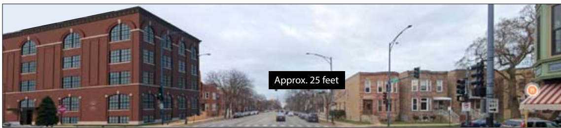
The new building on Ashland virtually fills all of the available space on the property's site, vertically as well as horizontally, towering twice as tall as the neighboring buildings within 250 feet.

Maybe one of these blob monstrosities grew on your block too? It's happening all over the North Side. You know, one of those bland, cookie-cutter high density apartment projects that spread lot line to lot line and add new density on the block.