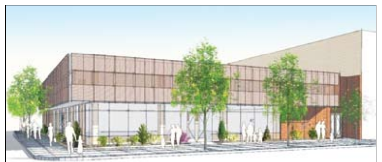
Artist's rendering of the proposed natatorium that would be located at Broadway and Thorndale in the Edgewater community.