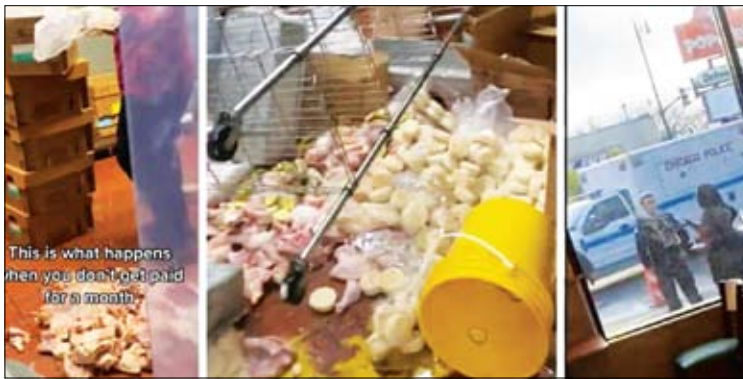
Chicago police officers responded to the Popeyes Chicken at 1959 W. Howard St. just before 6 p.m., April 24 to handle a call of criminal damage in progress.

Officially, a CPD spokesperson confirmed that a "known man" entered a business in the 1900 block of W. Howard on April