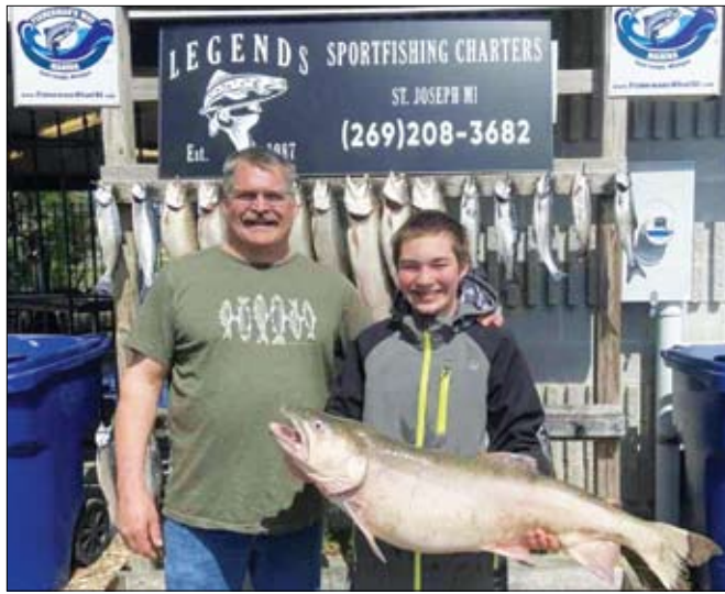
Many types of fish are available on Chicago's Lakefront, such as Coho and Chinook salmon, Steelhead Rainbow and Brown Trout, Yellow Perch, Smallmouth, Large-mouth and Rock Bass, Bluegill, Crappie, Sheepshead, Carp and Channel Catfish.

But it's not just trout and salmon rocking the reels these days. With 13 stocked park lagoons, a number of ponds, a reviving Chicago River, 22 miles of shoreline along Lake Michigan, and access in nine harbors and along the North Side of Navy Pier, Chicago offers many opportunities for year-round fishing. The types of fish to pursue are varied: Coho and Chinook