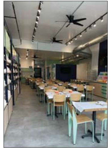
Embrace your creativity, whether a beginner or a more advanced artist, at Color Me Mine, 3849 N. Lincoln Ave.

special events and promotions throughout the month of May. In honor of Mother's Day, Color Me Mine North Center is hosting a series of special events. On May 11 and 12 they are hosting Mother's Day celebration where moms, grandmas, and all maternal figures can bond with their loved ones and create cherished keepsakes together.