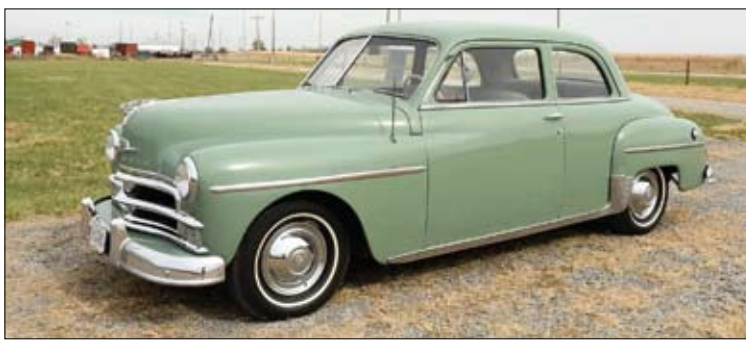
The roads we traveled were small ones, not a super highway anywhere yet. We saw America at our leisure, with our rosaries rattling in the backseat of our Plymouth.

Whenever I see vintage photos of my father and me, I cannot get over how very young and filled