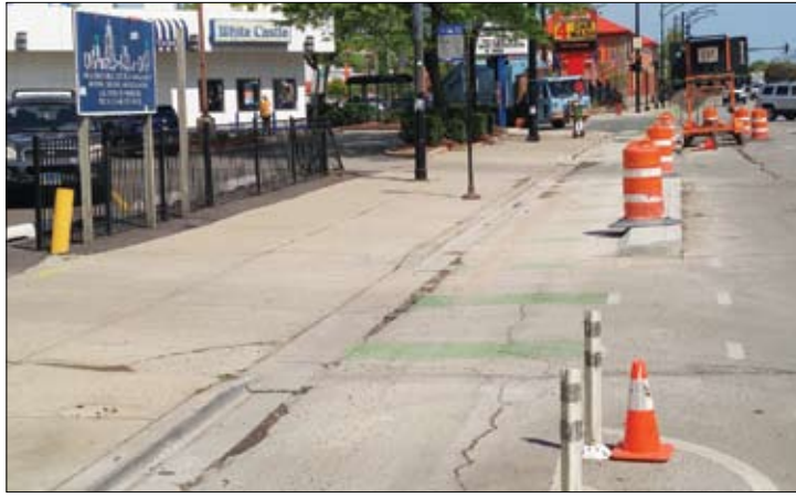
Over the last month, the City of Chicago has been busy at work in Northwest Edgewater 'fixing' this stretch of Clark St. and Ashland Ave., from Edgewater Ave. north past Devon Ave.