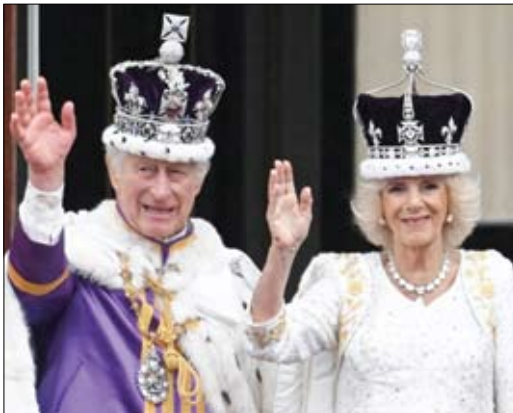
King Charles III and Queen Camilla.