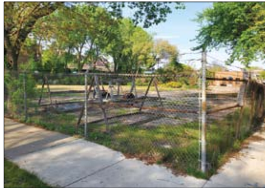
Property currently used by the Fertile Urban Garden Center in Southwest Lakeview may soon be used for construction of 18 single family homes.