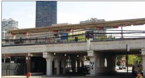
(L) The Lawrence Avenue station, in the shadows of the iconic Aragon Ballroom, will get a complete facelift during the CTA's modernization project, which is scheduled for completion in late 2124. (R) The Berwyn station is one of four scheduled L stations scheduled for re-construction as part of the CTA's Red and Purple Modernization Project.